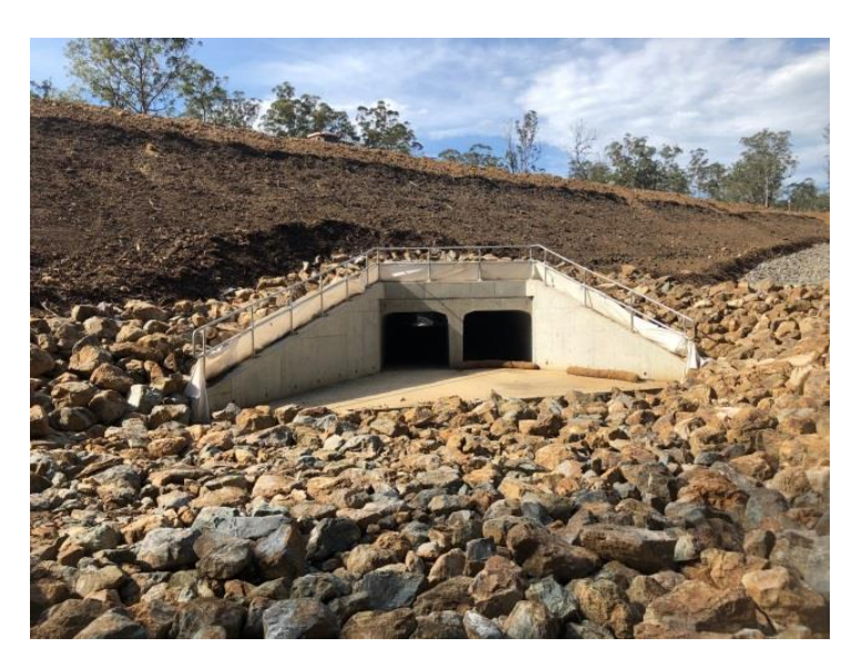
Above: Newly constructed box culvert to improve drainage