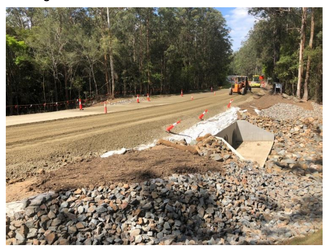
Above: Pavement work at Yippin Creek

We thank motorists for their continued patience during this work.