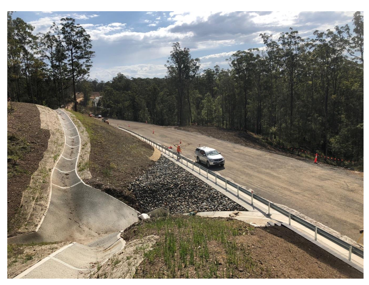
Above: View of the new alignment looking west

Roads and Maritime Services | December 2018