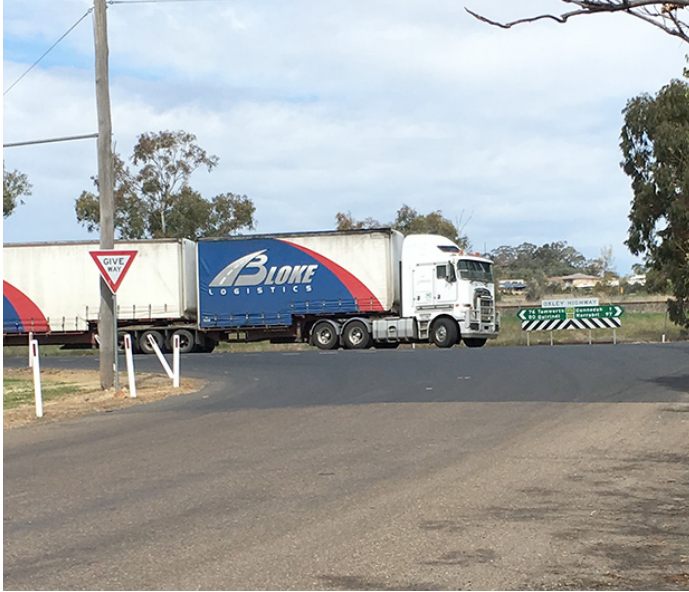
The Boundary Road intersection