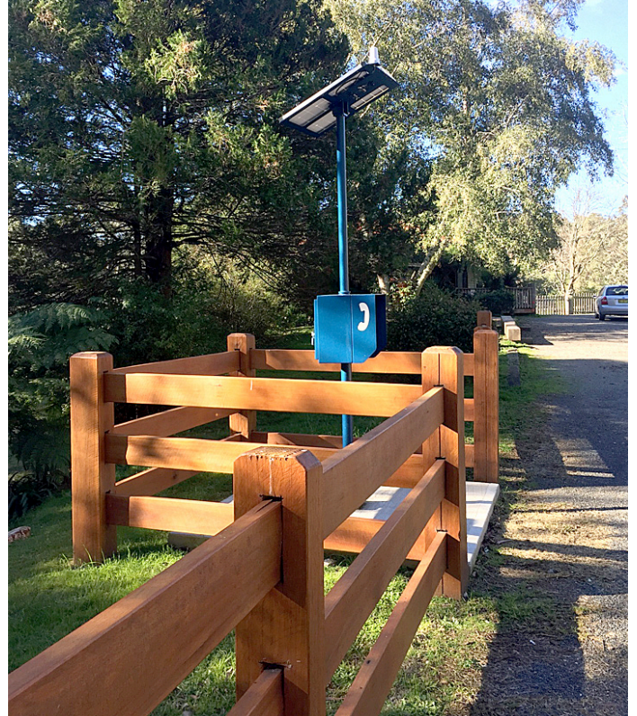
An emergency phone installed at Gingers Creek Road House, one of five along the Oxley Highway

Phone users are reminded that these emergency phones use satellite technology and there can be a slight delay for your message to reach the other party and when they respond. Please be patient and wait for the reply before you continue with the call. We recently upgraded the solar panels to improve the reliability of the phones.