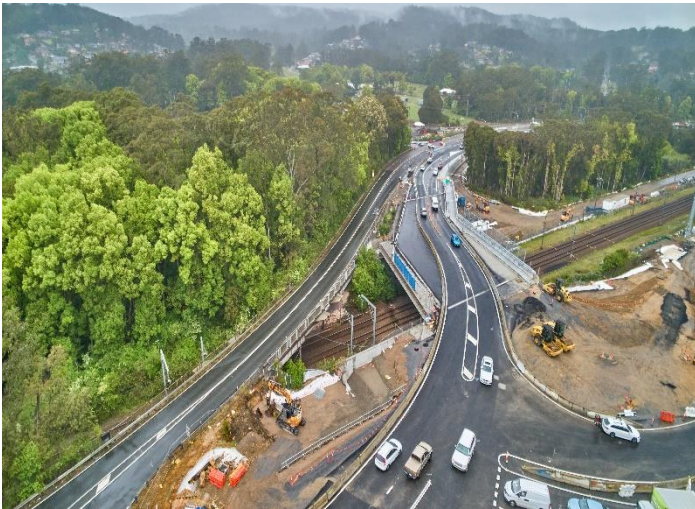
Vehicles travelling across the first half of the new rail bridge, October 2021

Transport for NSW contracted Daracon Group to build the 1.6 kilometre section of the highway between Ourimbah Street and Parsons Road at Lisarow. Work started in February 2019 and the project is expected to be complete late 2023.