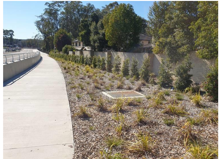
Landscaping and pedestrian path on the Pacific Highway near Parsons Road, September 2021

There are a number of retaining walls on the project. The longest and highest is the retaining wall in front of Lisarow Cemetery which is more than six metres high and 100 metres long and has sandstone feature facing panels. The original cemetery gates will also be reinstated along with new sandstone block feature work.