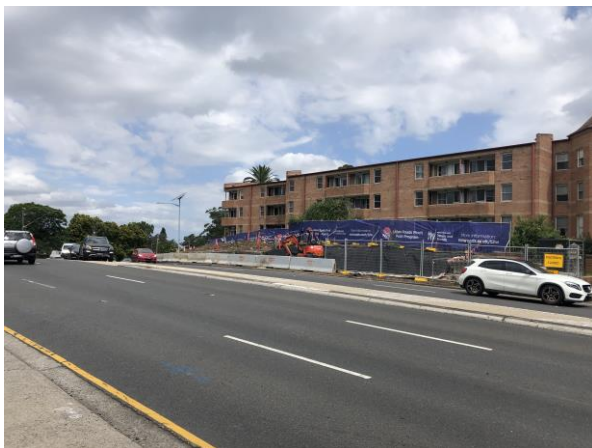
The Pacific Highway and Redleaf Avenue: work continues.