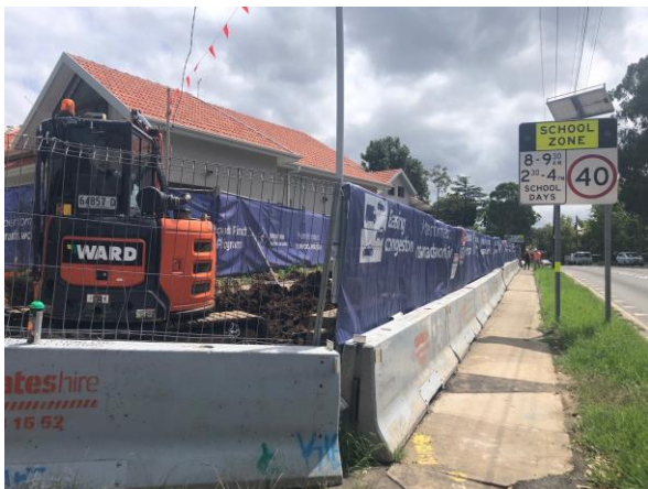
The Pacific Highway and Fox Valley Road: work continues.