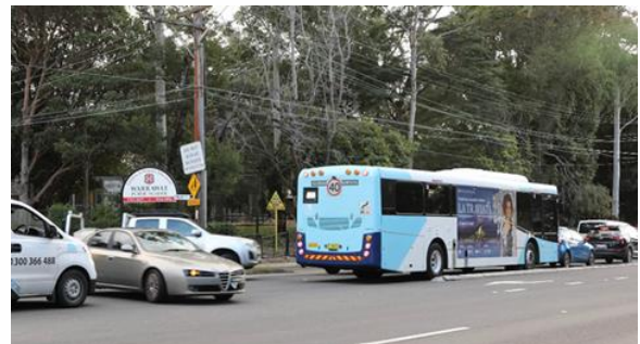
Pacific Highway at Finlay Road: unsafe right turns before the upgrade