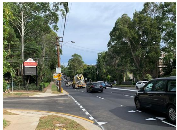
Pacific Highway at Finlay Road: three northbound lanes and completed road median