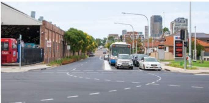
The new additional lane on Shaftesbury Road will allow more vehicles to move through the intersection.

The project was funded under the NSW Government's Pinch Point Program, which aims to reduce delays, ease congestion and improve journey reliability on Sydney's main road, particularly during week-day peak periods.