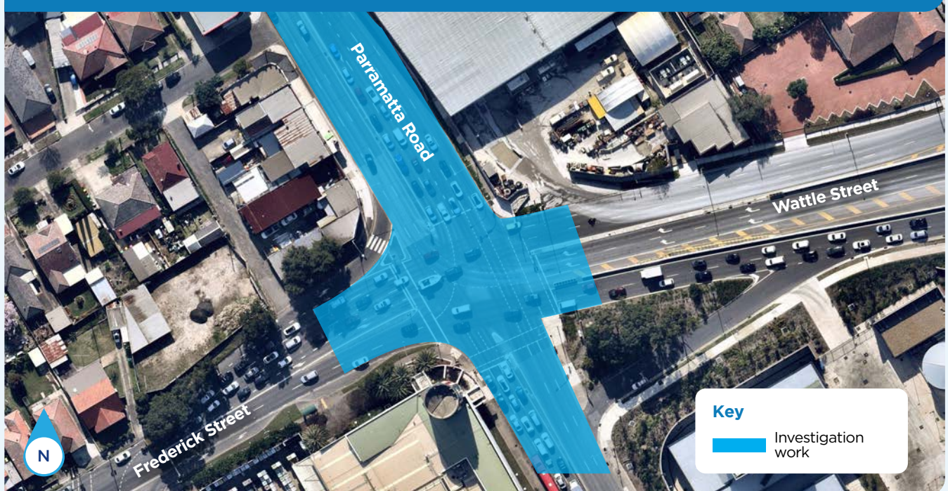
Location of investigation work from 31 August 2020 on Parramatta Road, Wattle Street and Frederick Street, Ashfield

For the latest traffic updates, you can call 132 701, visit livetraffic.com or download the Live Traffic NSW App.