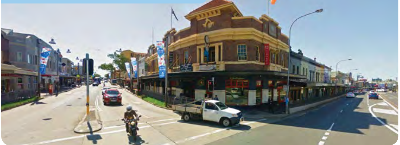
Parramatta Road and Norton Street, Leichhardt

We're planning to improve traffic flow along Parramatta Road between Rofe Street and Cannon Street, Leichhardt to make your journey easier, faster and safer.