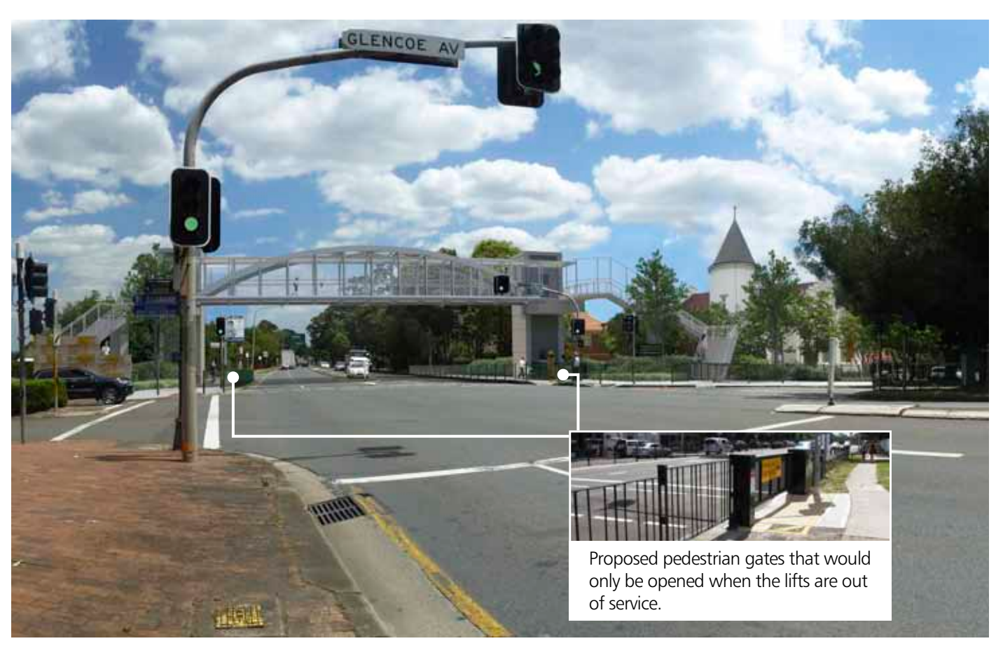
Looking south-west on Pennant Hills Road

The concept design for the proposed pedestrian bridge was developed to minimise the impact to heritage structures in the area. The large pillars and gates at the entrance to the Burnside Gardens will remain in place and protected during the work. Heritage features including the existing boundary fence and stone pillars at the front of Redeemer Baptist School and next to the Burnside Shopping Centre may need to be relocated to enable construction of the proposed bridge but will be put back after the project is finished.