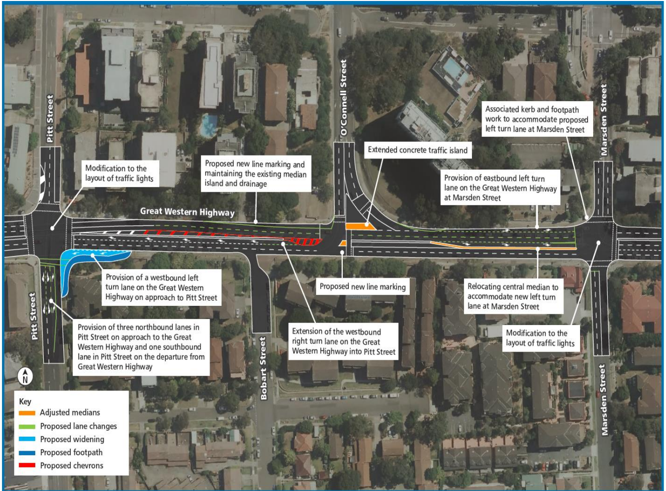
Figure 1: Proposed intersection improvements along the Great Western Highway at Pitt Street and Marsden Street, Parramatta