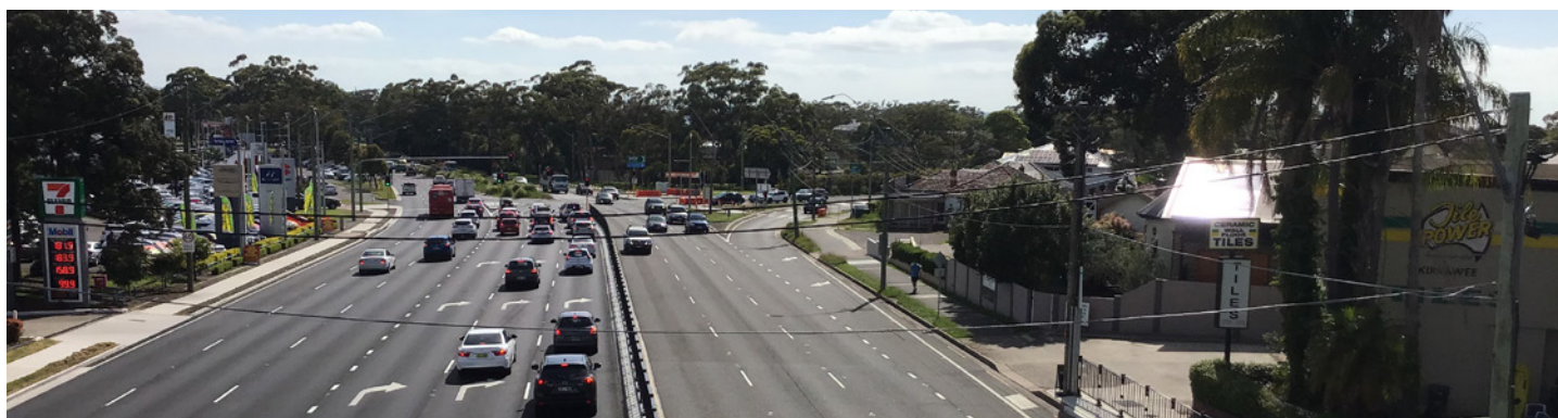
Princes Highway looking eastbound from Bath Road

Transport for NSW has been upgrading the Princes Highway between the intersection of Kingsway, Oak Road and Acacia Road and the intersection of Acacia Road and President Avenue. These upgrades will improve traffic flow, travel times and safety for all road users, particularly during peak periods. The project is entering the final stages with completed works being progressively opened to traffic.