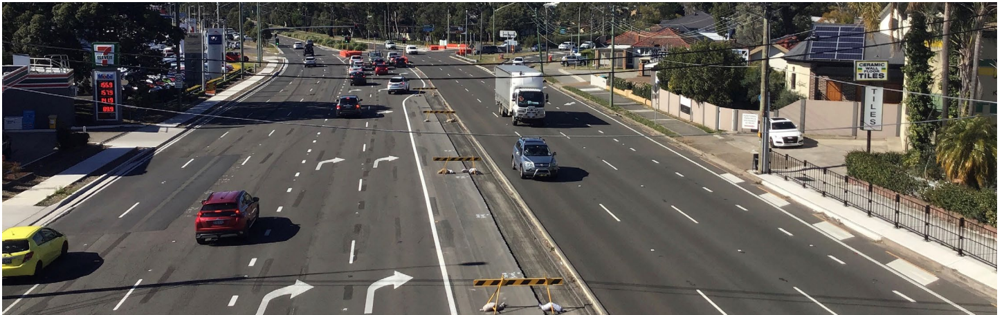
Princes Highway looking northbound from Bath Road

Transport for NSW is upgrading the Princes Highway between the intersection of Kingsway, Oak Road and Acacia Road and the intersection of Acacia Road and President Avenue. These upgrades will improve traffic flow, travel times and safety for all road users, particularly during peak periods.