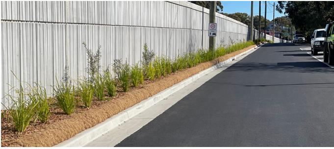
Princes Highway service road looking westbound from Peach Tree Lane.