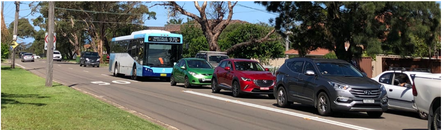
Traffic on Box Road (east) at the intersection with the Princes Highway, looking east.