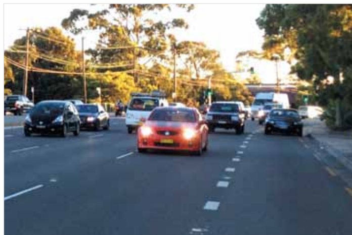
North of Holt Road on Princes Highway, Sylvania.

Clearways are not proposed where there are currently three lanes of through traffic and a parking lane. These