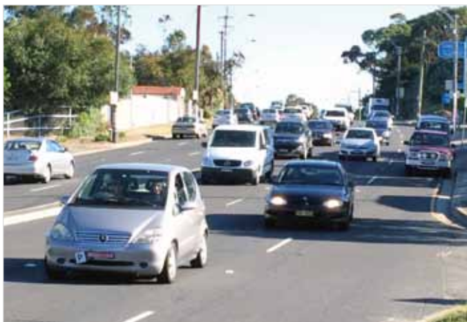
North of Tom Ugly's Bridge, Blakehurst.