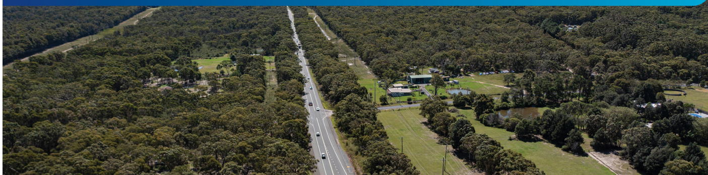
Princes Highway, looking north towards Jervis Bay Road

The priority section of the Jervis Bay Road to Sussex Inlet Road upgrade has been identified as the six kilometre upgrade between Jervis Bay Road and Hawken Road.