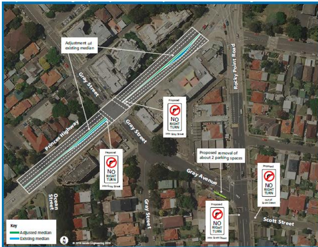
Figure 1- Proposed intersection improvements at the Princes Highway, Rocky Point Road and Gray Street, Kogarah.