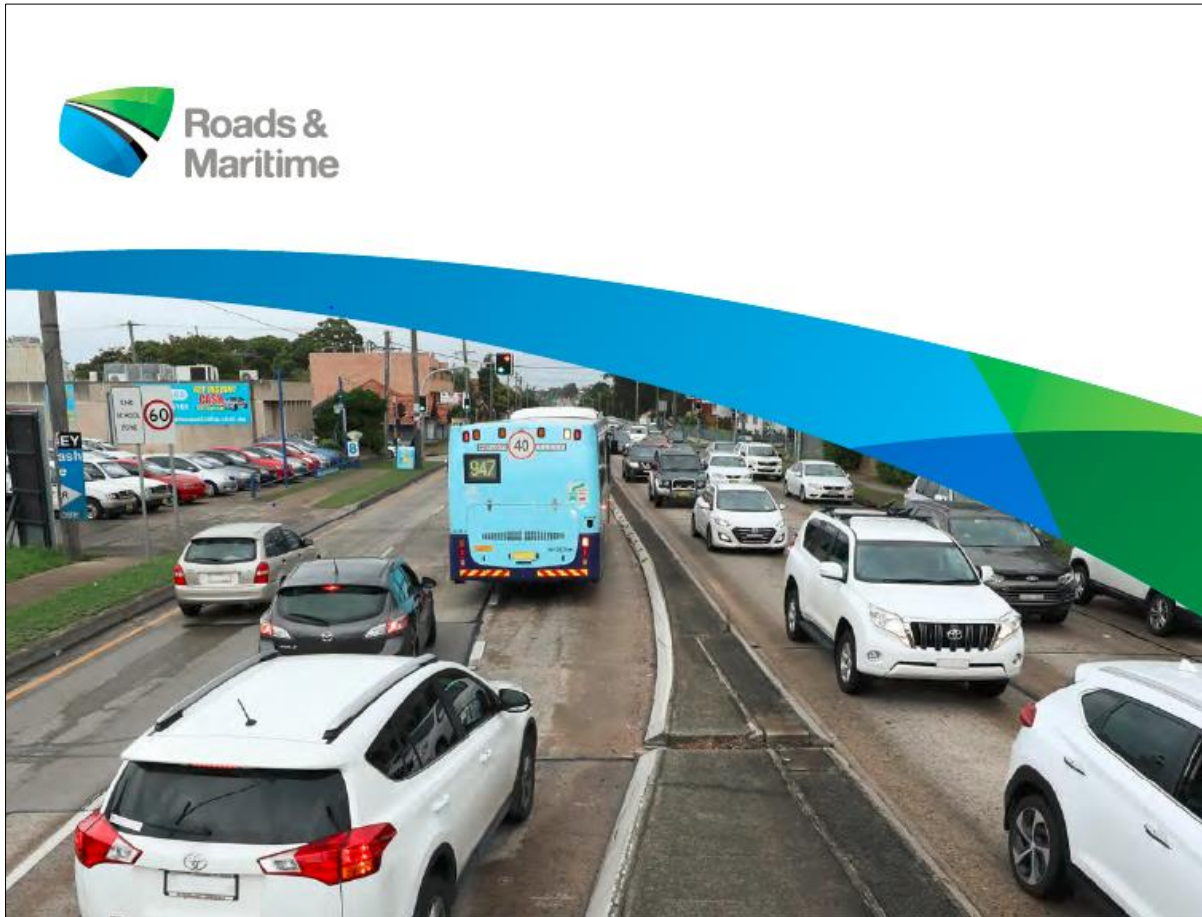
Congestion at Princes Highway / Gray Street, Kogarah