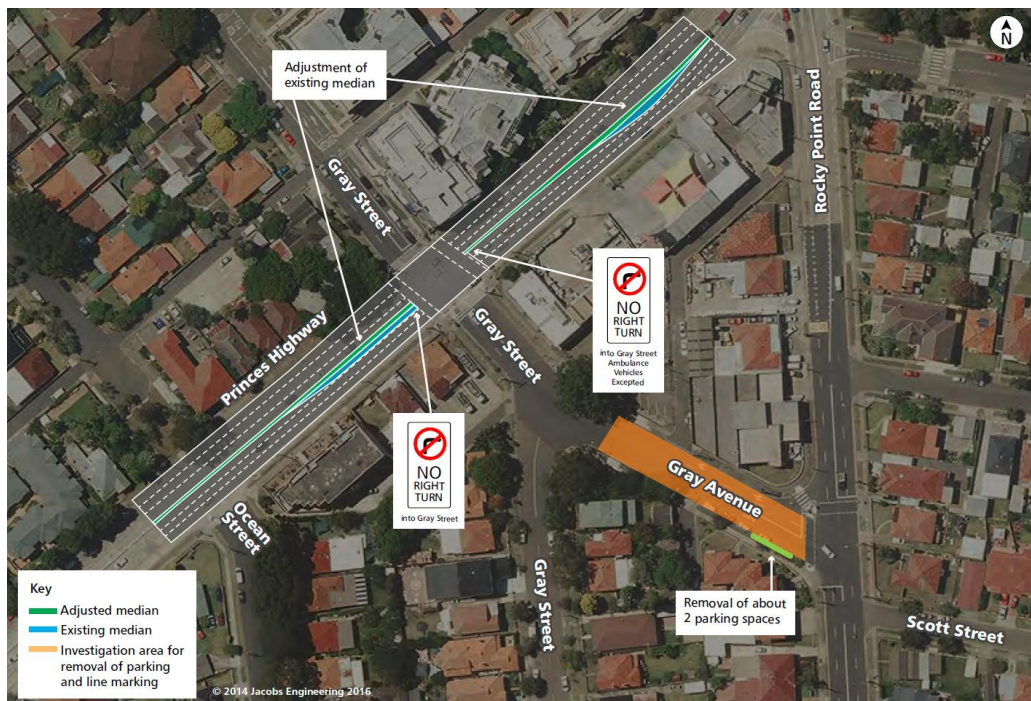
Figure 2- Updated intersection improvements at the Princes Highway, Rocky Point Road and Gray Street, Kogarah.