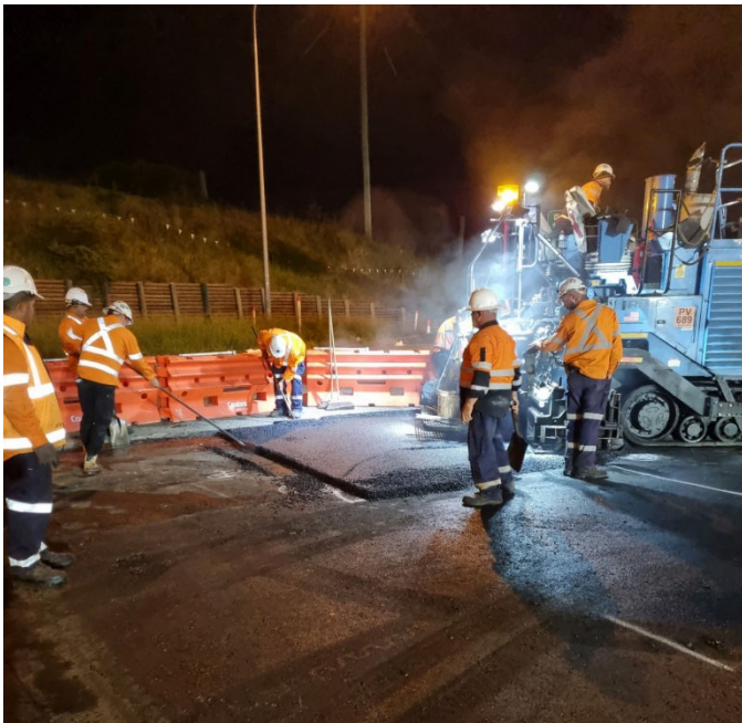
Works on the roundabout near the M4 off and on ramp completed in March.