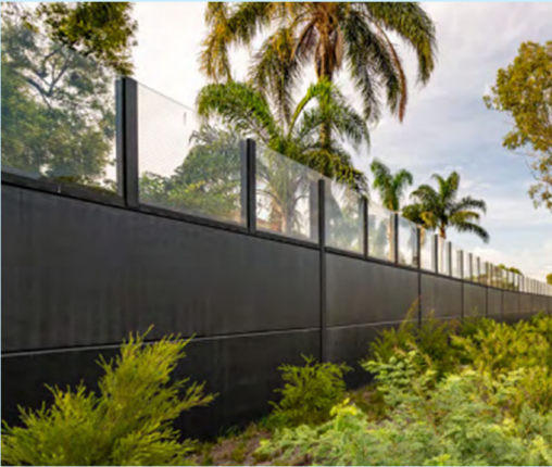
Example of the style of noise wall to be installed along the Prospect Highway. Note: Prospect Highway noise walls will be topped with clear acrylic panels.

Noise walls will range in height, length and distance from fence lines of property boundaries depending on their location. Further consultation will occur with nearby residents.