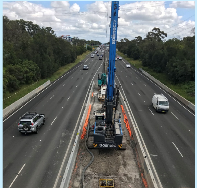
Right: Piling rig in place for the pillar of the new bridge over the M4 completed in March.