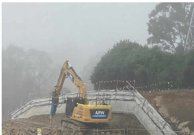
Many works have been delayed by this year's wet weather such as excavation of retaining walls across the project.

Wet weather affects the drying time of concrete and asphalt. It can also damage the materials being used, making them less durable and effective. Wet weather can also create safety hazards for workers and the community when doing certain activities. For example, excavating in the rain has the potential to cause incidents like trenches caving in.