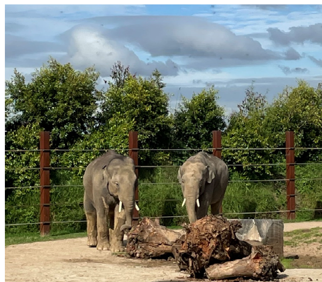
Elephants at Sydney Zoo enjoying freshly delivered stumps removed as part of the Prospect Highway Upgrade.