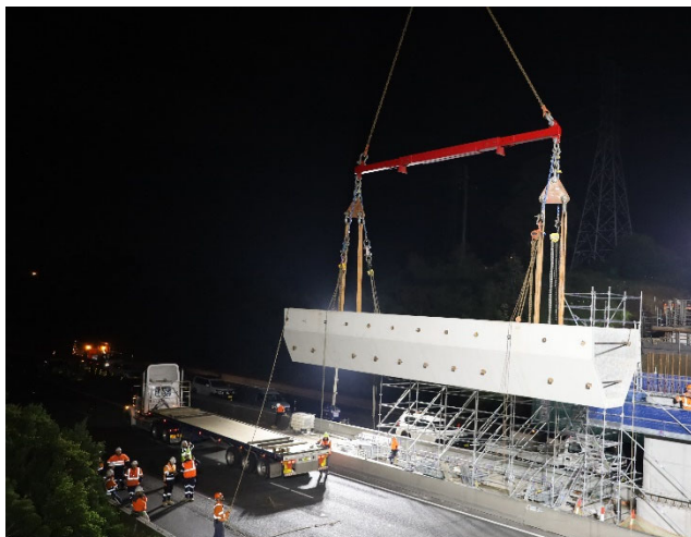
Installation of concrete bridge elements on the M4 Motorway.