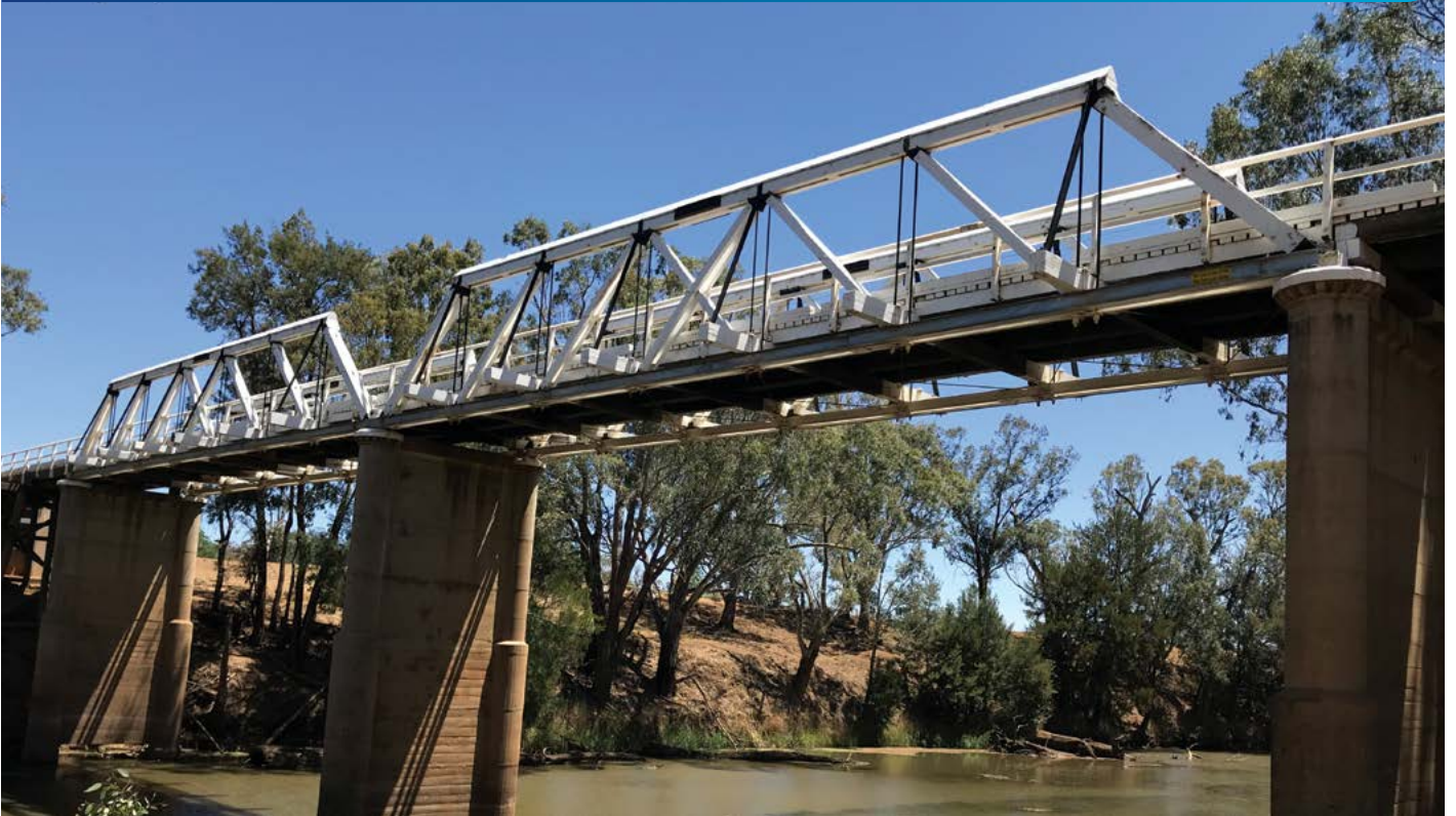
Rawsonville Bridge over the Macquarie River, west of Dubbo