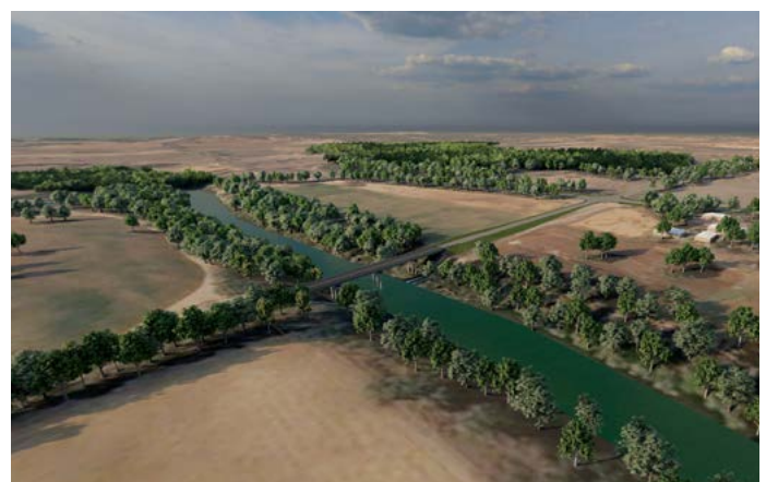
Artist's impression of the new Rawsonville Bridge