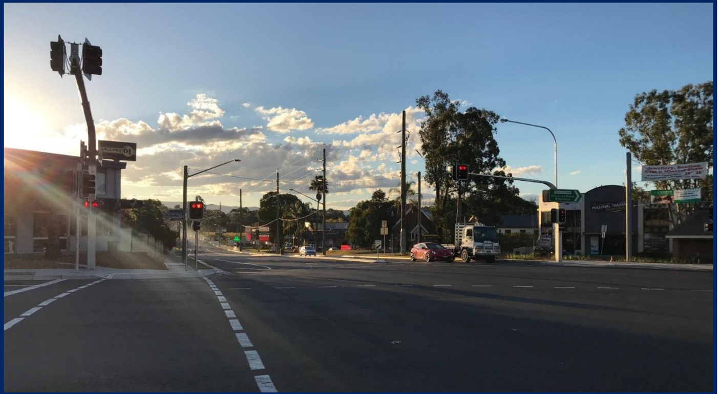
Intersection of Bells Line of Road, Grose Vale Road and Terrace Road northbound, North Richmond

Bells Line of Road is an important road linking north western Sydney with central and western New South Wales. Motorists were experiencing heavy congestion at a number of intersections near the Richmond Bridge, particularly during morning and afternoon peak periods.