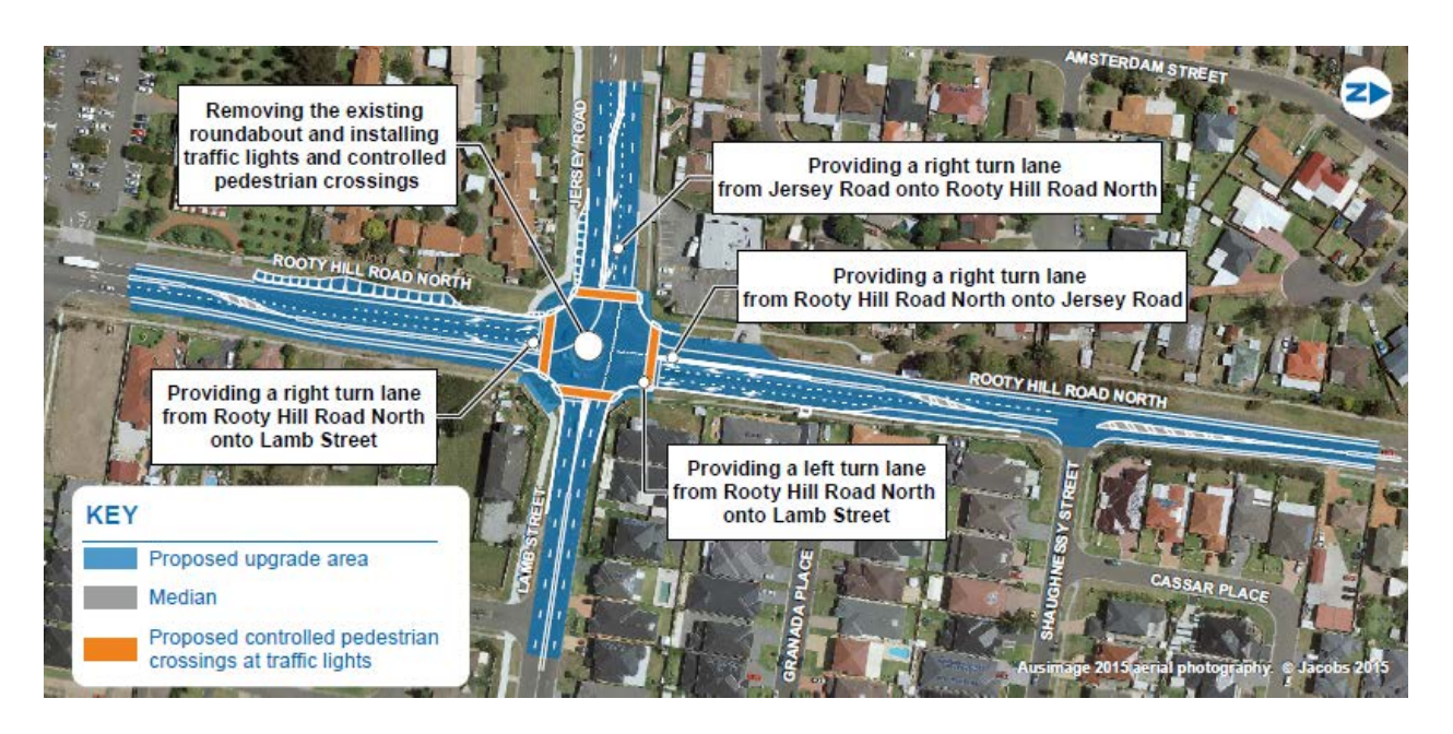
Image One: Proposed improvements to the intersection of Rooty Hill Road North, Jersey Road and Lamb Street, Plumpton