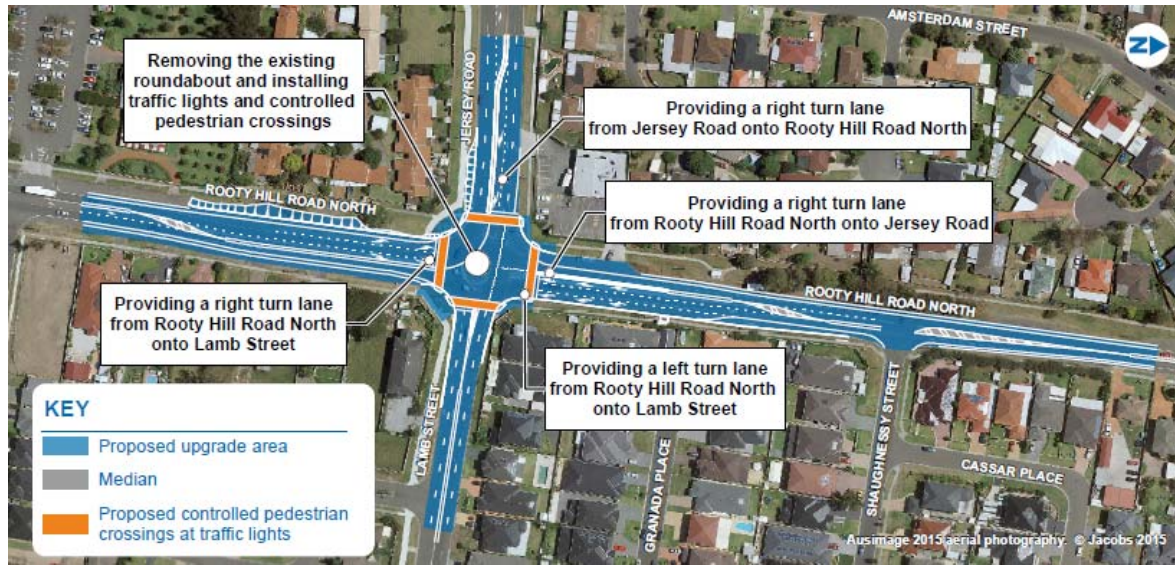
Image One: Improvements to the intersection of Rooty Hill Road North, Jersey Road and Lamb Street, Plumpton