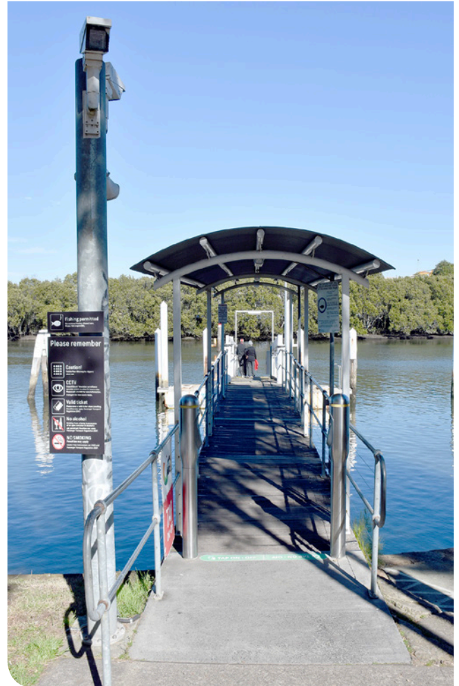
The existing Rydalmere Wharf gangway

Customers are encouraged to plan their trip by visiting transportsw.info or calling 131 500 before starting their journey.