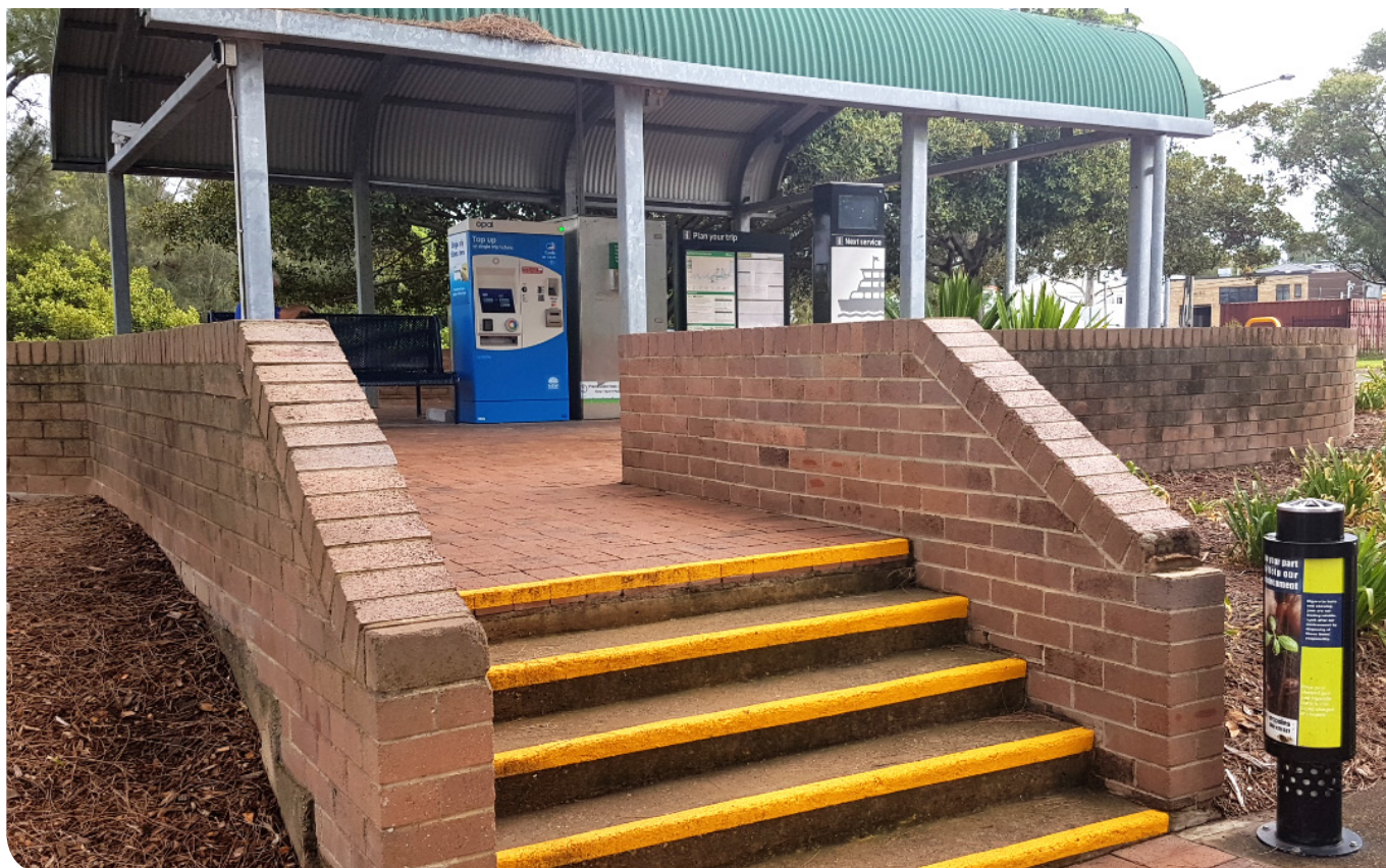
The existing shelter at Rydalmere Wharf to be retained