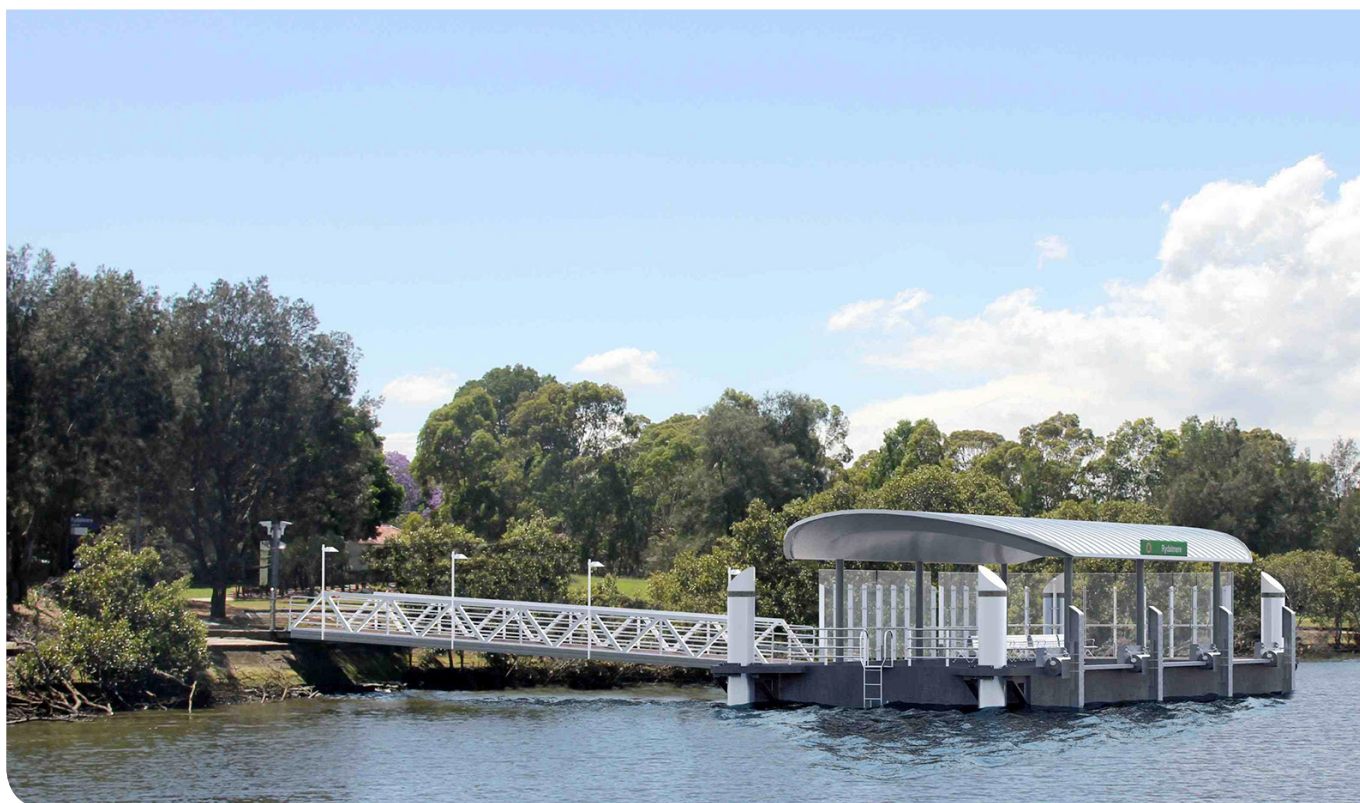
Artist's impression of the new Rydalmere Wharf viewed from the water

The NSW Government is upgrading Rydalmere Wharf as part of the Transport Access Program – an initiative to deliver modern, safe and accessible transport infrastructure across the state. Following feedback from the community the Review of Environmental Factors for the project has been finalised and work to upgrade the wharf will start on Wednesday 3 October 2018 .