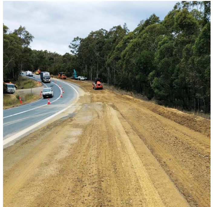
Princes Highway upgrades between Cranbrook and Lattas Point Roads

Separately funded through the NSW Government's Saving Lives on Country Roads program, these road upgrades provide an immediate safety benefit for motorists.