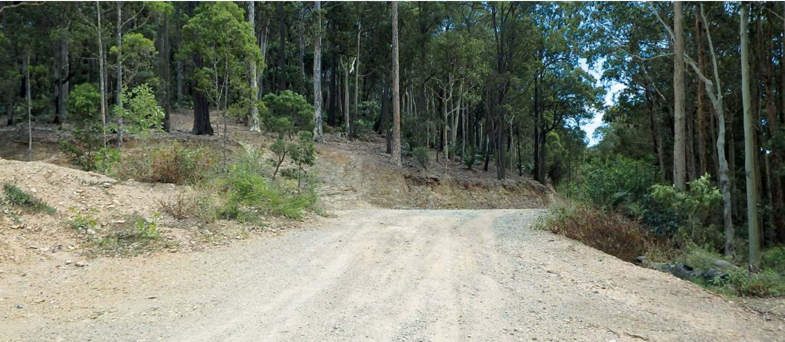
The unsealed road, The Ridge Road near Glenella Road.

Roads and Maritime Services is developing plans for a safe and efficient connection for the Link Road and Princes Highway south of Batemans Bay.