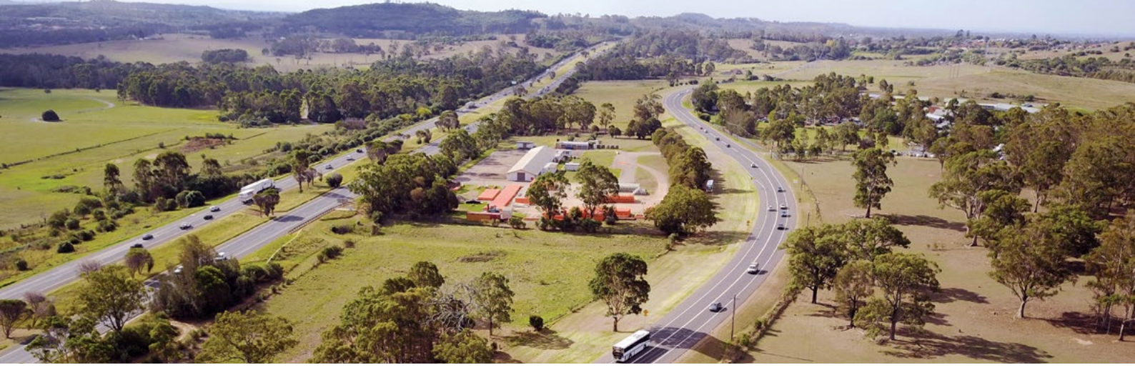
Existing traffic on the Hume Motorway and Menangle Road

Roads and Maritime Services | February 2019