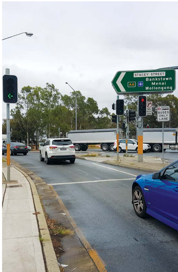
Hume Highway to Stacey Street, Bankstown

The project is in the concept design stage. Our investigations are helping us design the new road, including where it should be widened, as well as other improvements. Once further details on the project are known, the community will have the opportunity to ask questions and provide feedback on the proposed design.