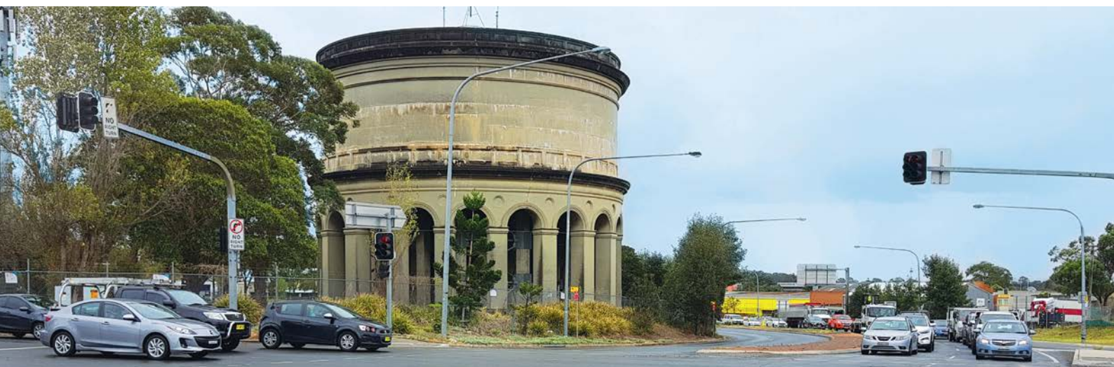
The intersection of Stacey Street and the Hume Highway, Bankstown

The NSW Government is investing in the planning and development of the upgrade to reduce congestion and improve safety in Bankstown.