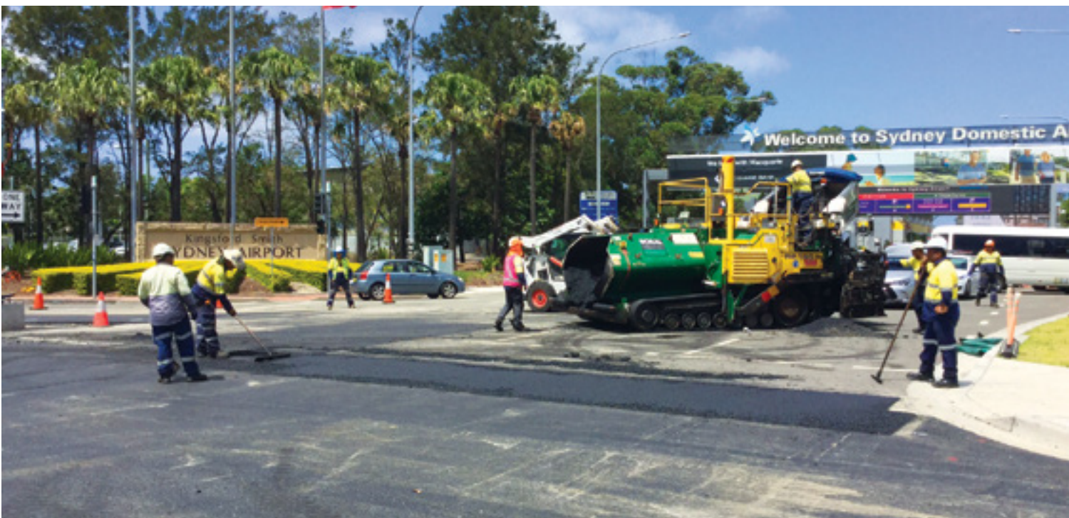
Asphalt being laid as part of the Joyce Drive intersection rebuild

The Australian and NSW Governments are upgrading roads east of Sydney Airport to improve traffic flow and access to the airport and Port Botany.