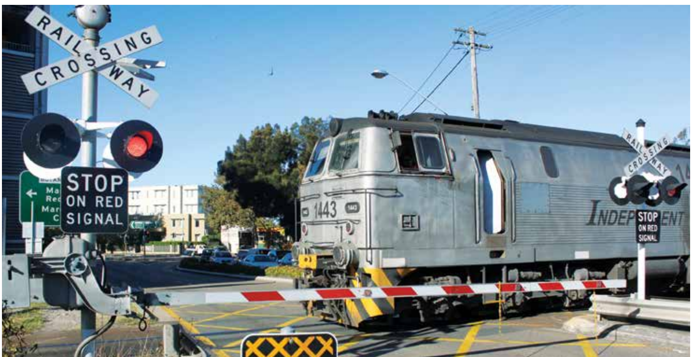
General Holmes Drive railway level crossing