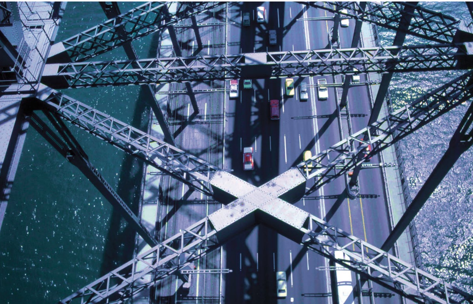
Sydney Harbour Bridge viewed from above

Review of Environmental Factors – February 2020