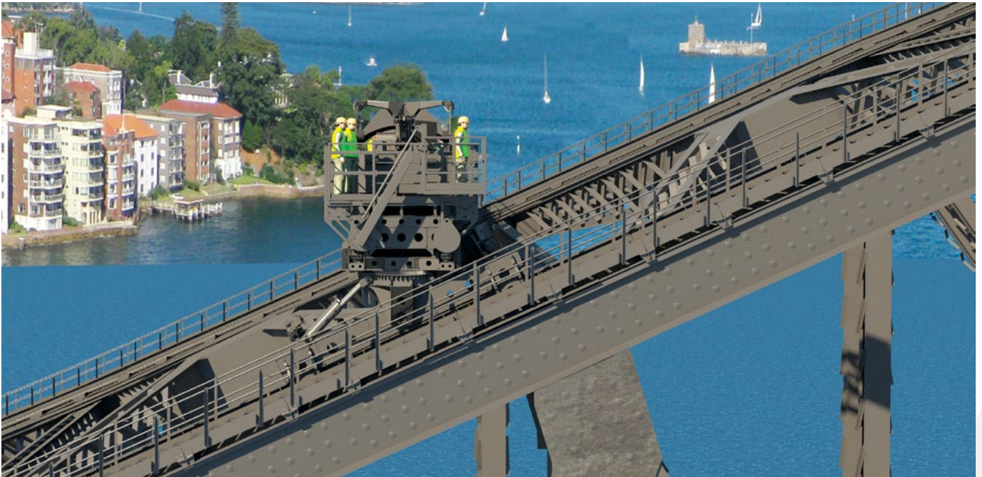
Artists impressions of one of the new arch maintenance units viewed from the side

Visual impacts from the Sydney Opera House have been assessed as minimal. Further detail about this and visual impacts from other areas can be found in the Review of Environmental Factors.