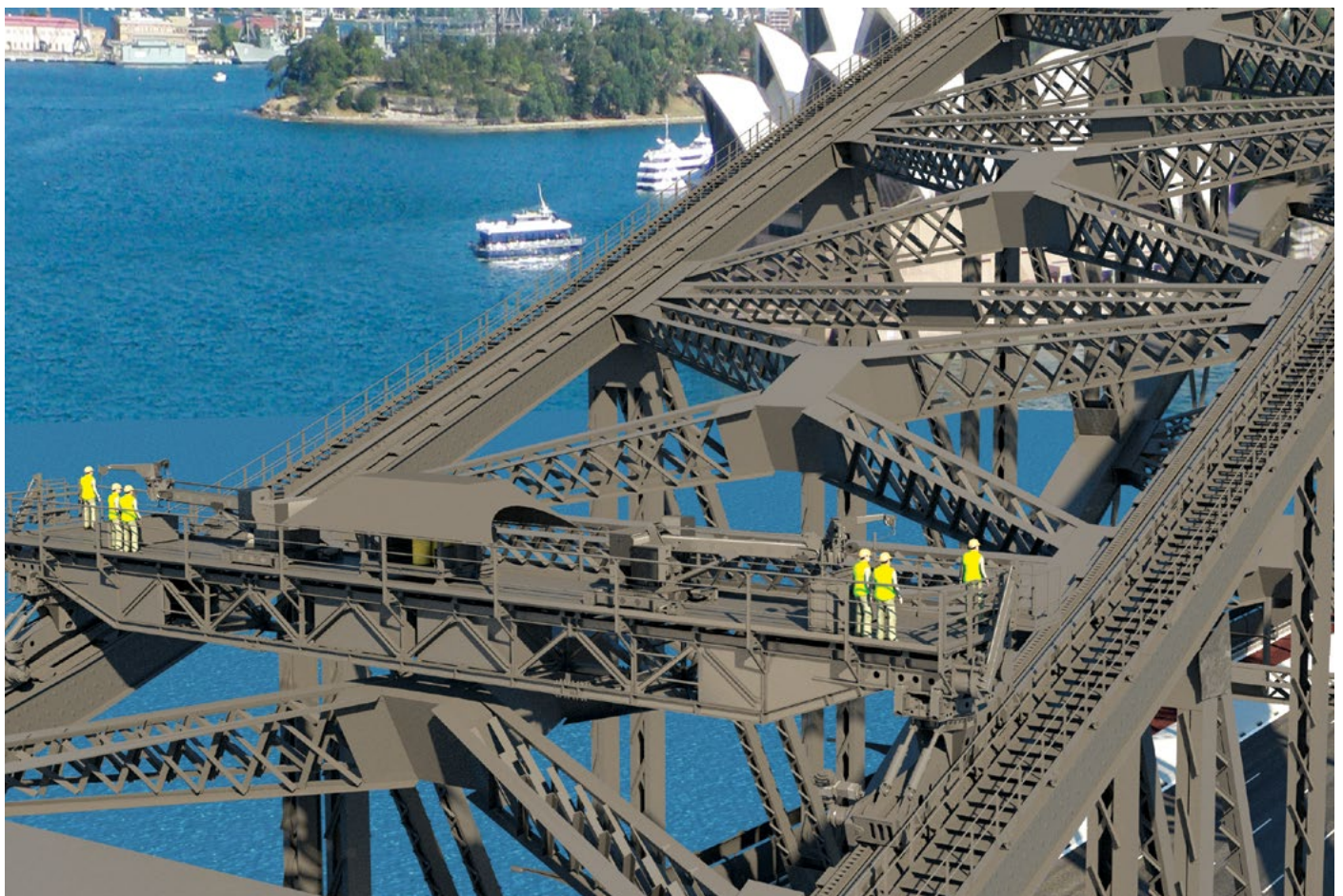
Artists impression of one of the new arch maintenance units