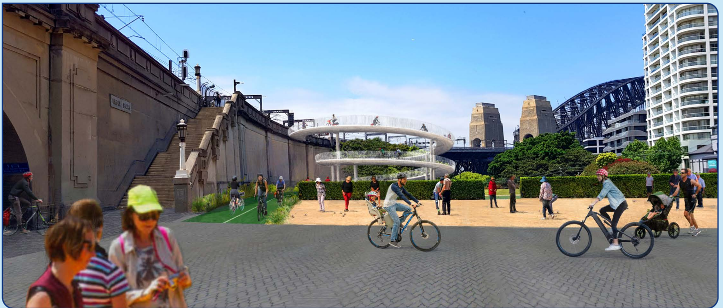
Artist impression of the looped option looking south from Burton Street

Double-loop ramp at Bradfield Park Central