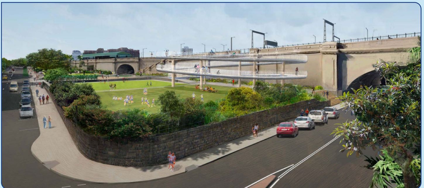
Artist impressions of the looped option looking north east from the corner of Fitzroy Street and Alfred Street