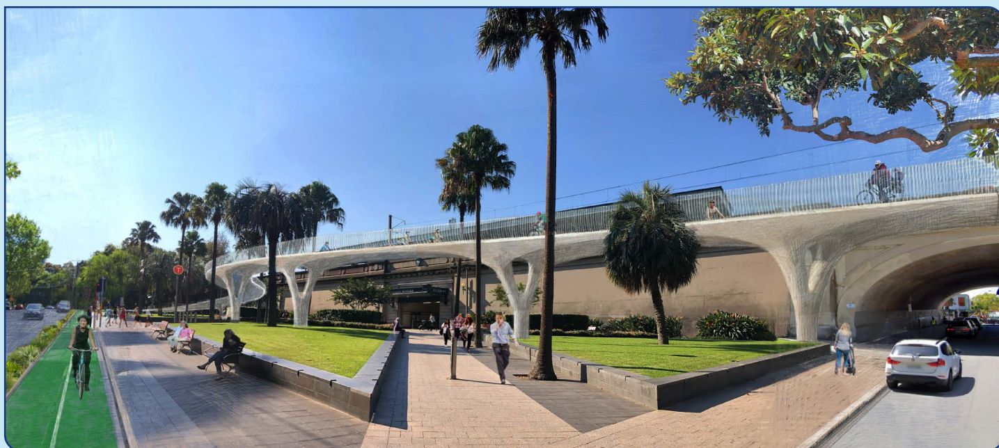
Artist impressions of the linear option looking north east from the corner of Burton Street and Alfred Street