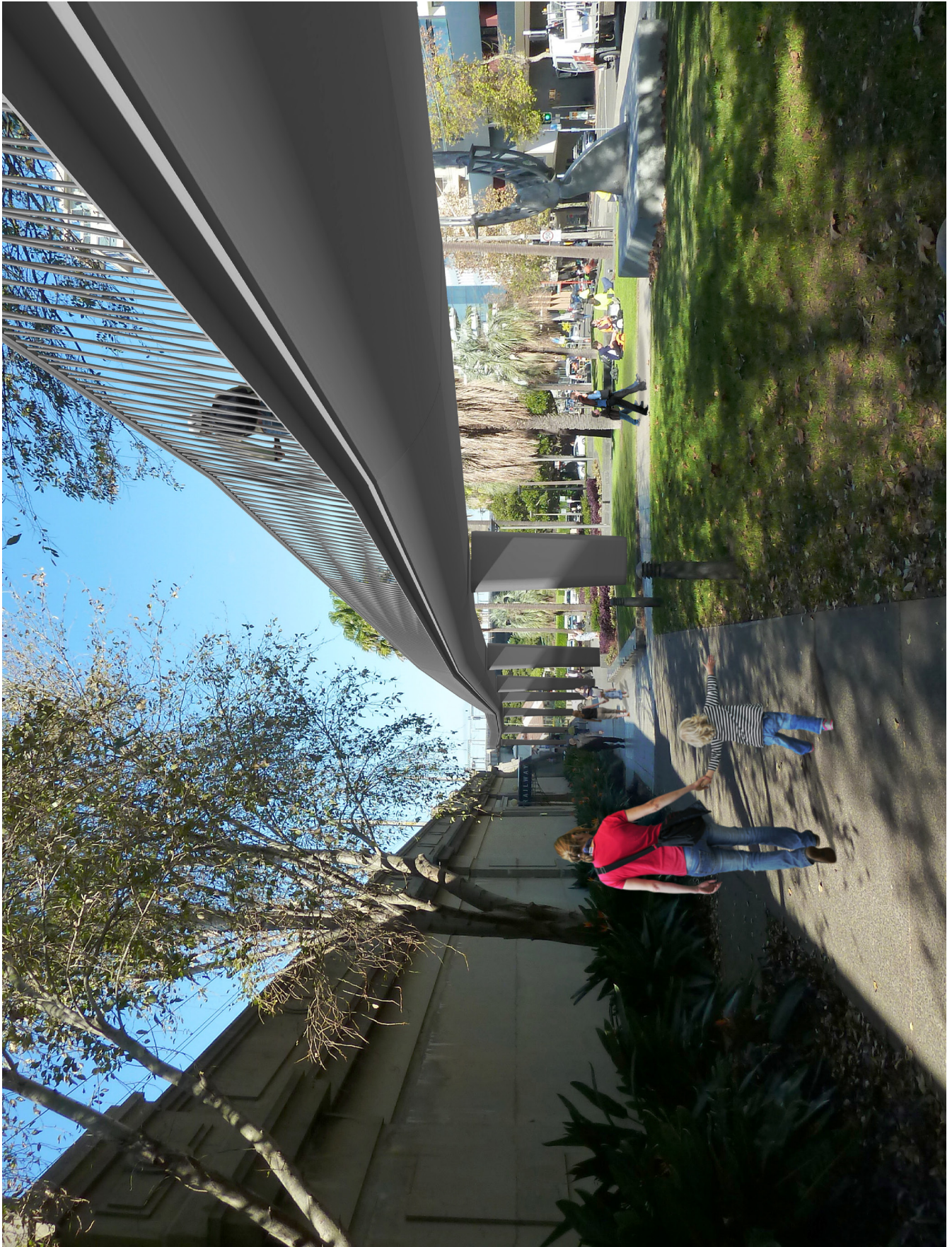
Figure B3: Parallel View of Horizontal Option 2 - Bradfield Park North