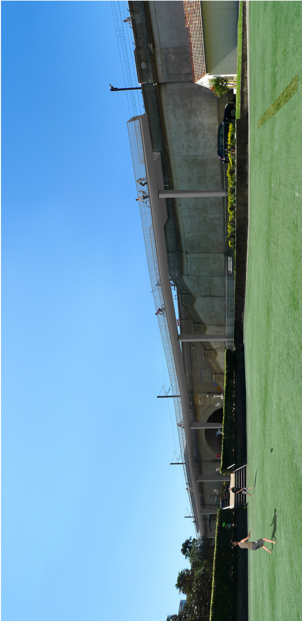
Figure B9: Structural Option 6 Banana Beam - View from Bowling Green