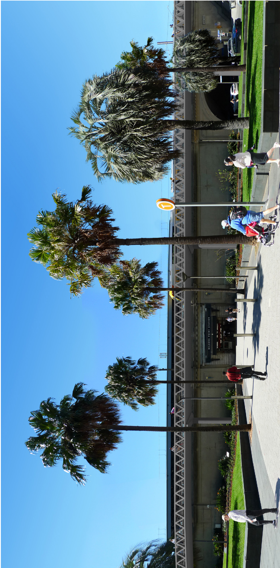
Figure B4: Structural Option 1 Warren Truss - Station View from Alfred Street South