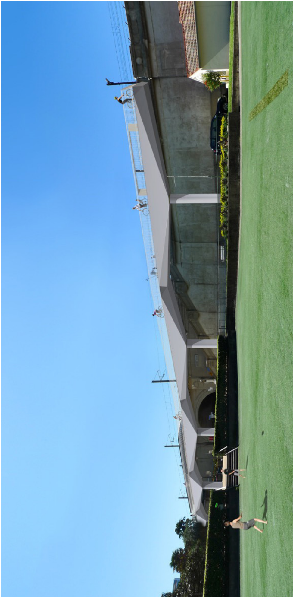
Figure B7: Structural Option 4 Shaped Beam - View from Bowling Green