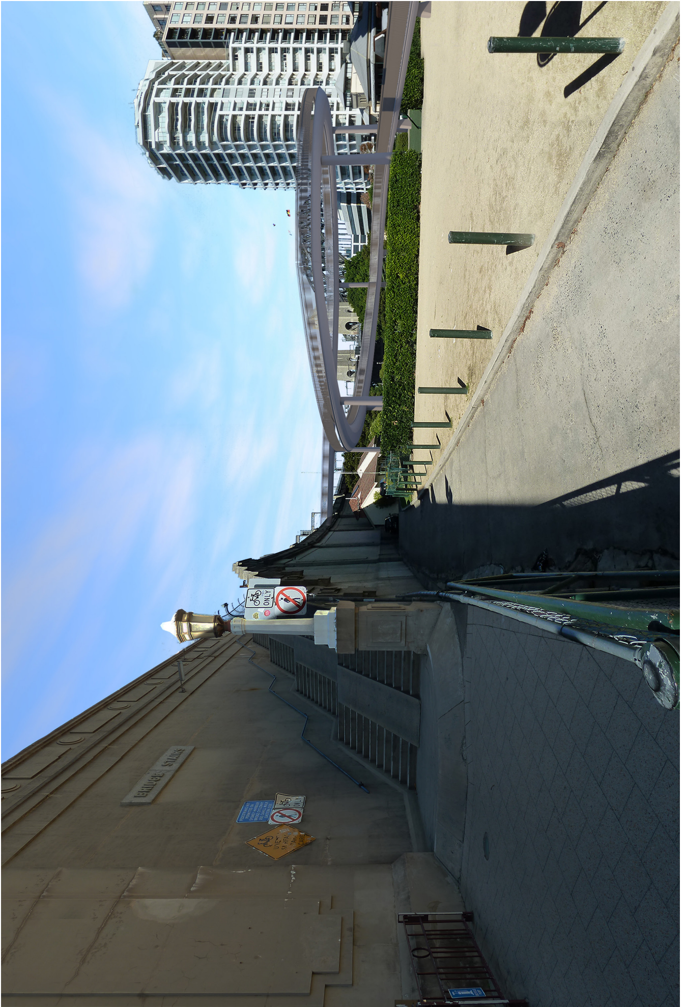
Figure B2: Horizontal Option 3 - View from Burton Street