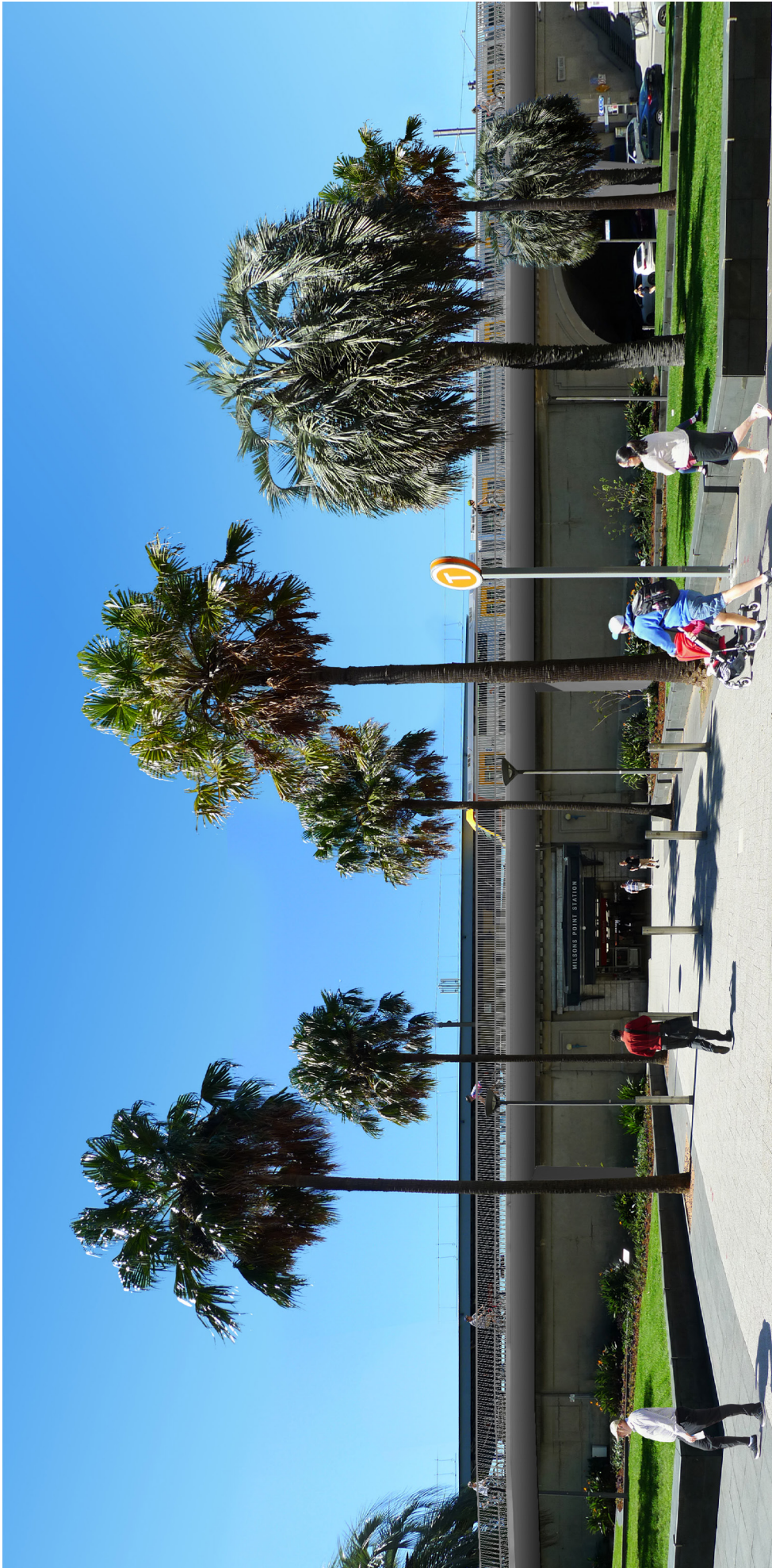
Figure B1: Horizontal Options 1 and 2 - View from Alfred Street South