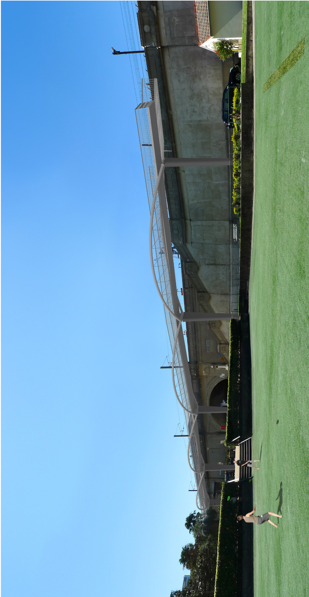
Figure B5: Structural Option 2 Through Arch - View from Bowling Green