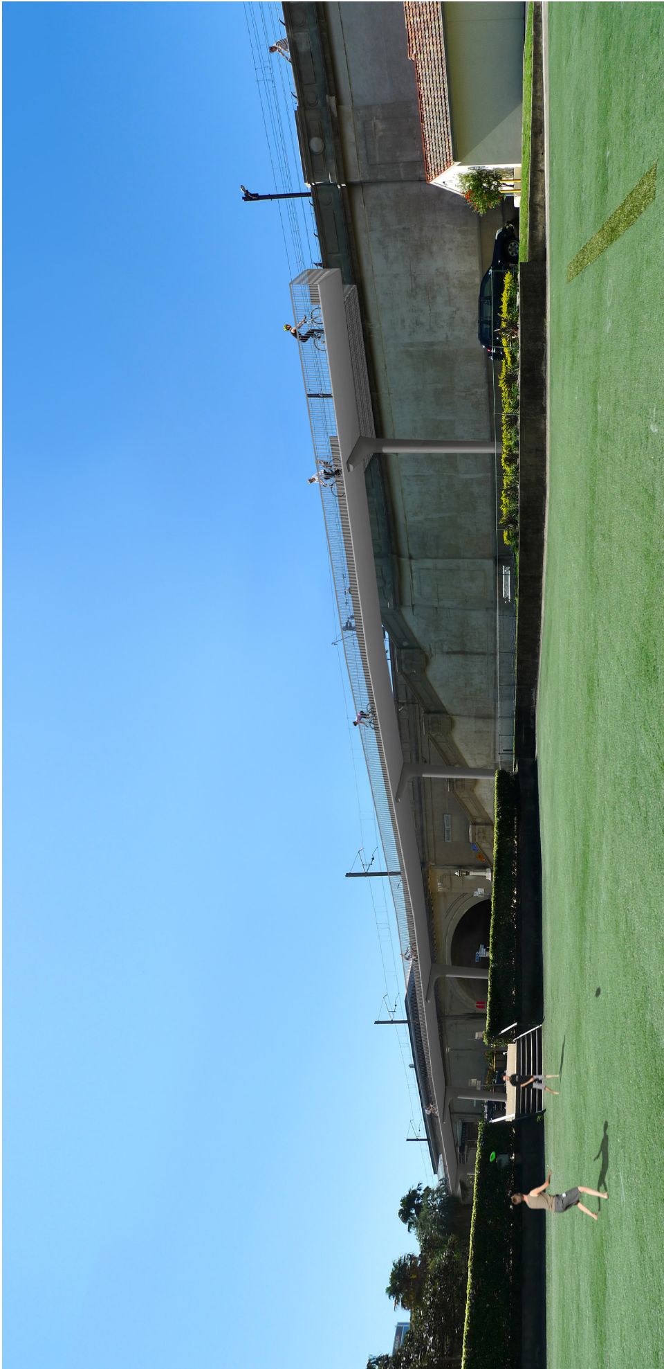
Figure B8: Structural Option 5 Torsion Beam - View from Bowling Green