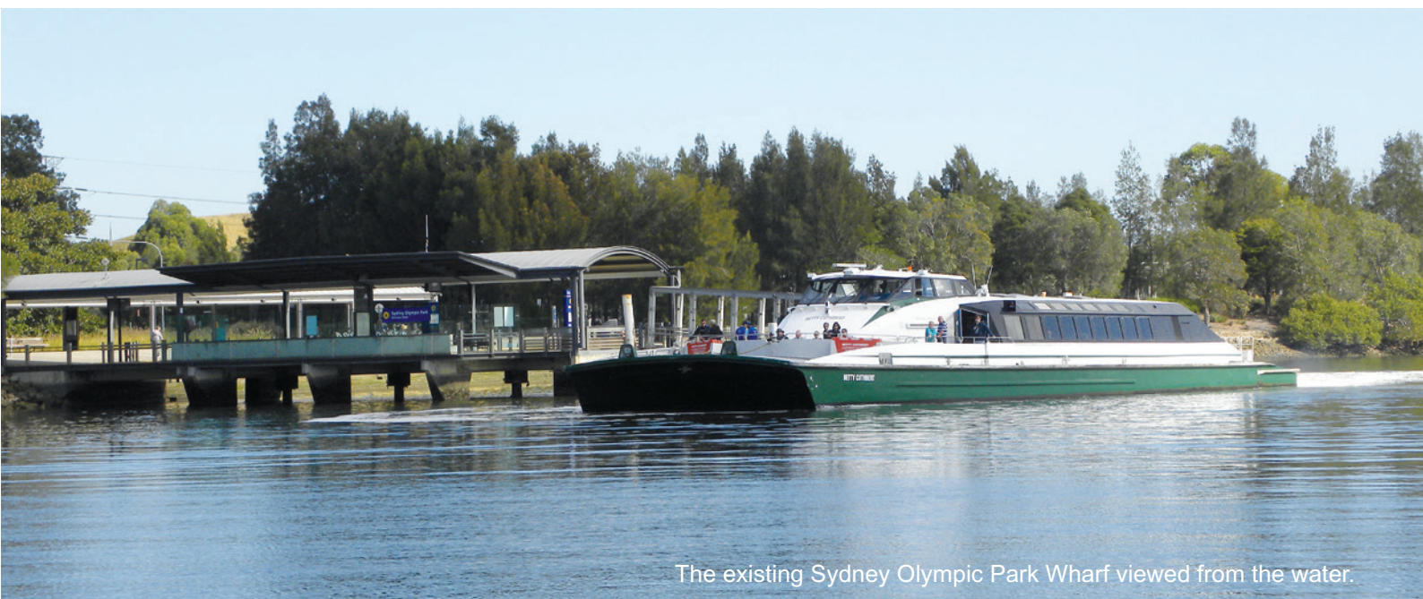
The existing Sydney Olympic Park Wharf viewed from the water.

The NSW Government is upgrading Sydney Olympic Park Wharf as part of the Transport Access Program. It is expected work will start in late 2014 and construction will take about five months. Sydney Olympic Park Wharf will be closed during this period.