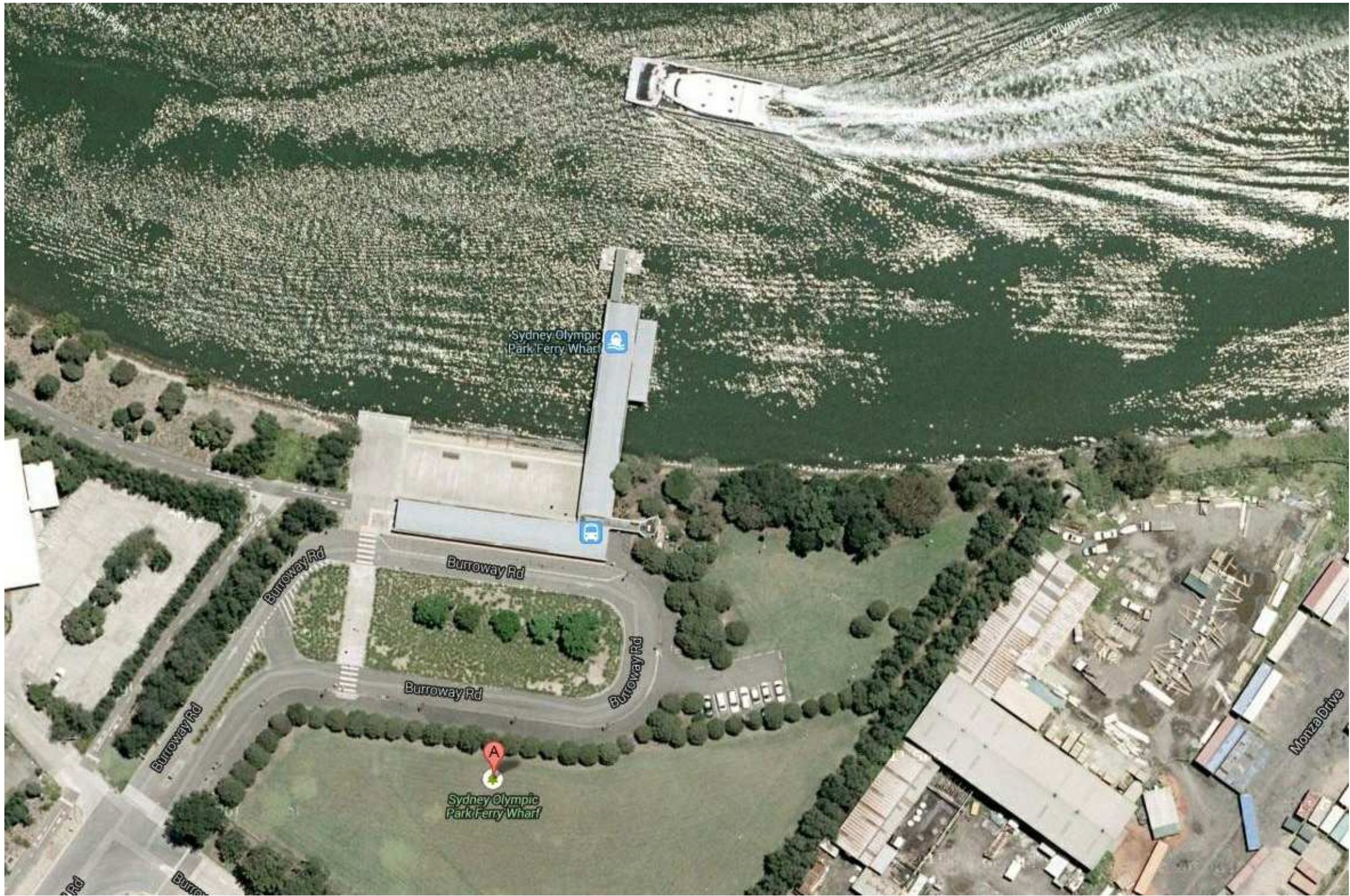
02 SYDNEY OLYMPIC PARK WHARF