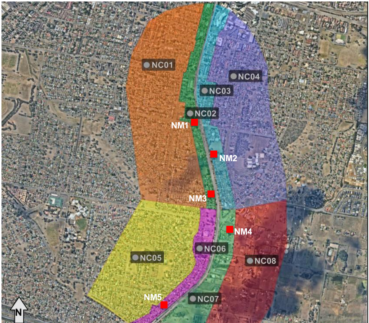
Figure 2: NCA 1-08