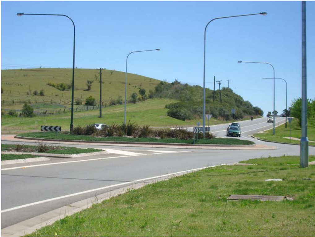
Photo 1 – Looking north along The Northern Road from Hillside Drive