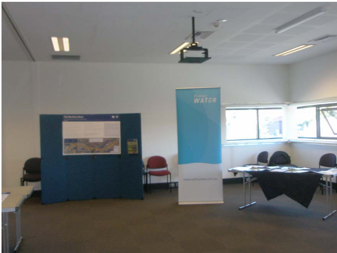
Community information session held on 14 August 2010 at Narellan Library.