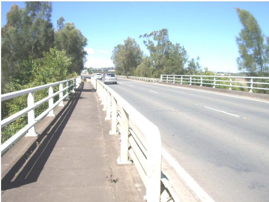
Photo 2 - Narellan Creek bridge travelling north