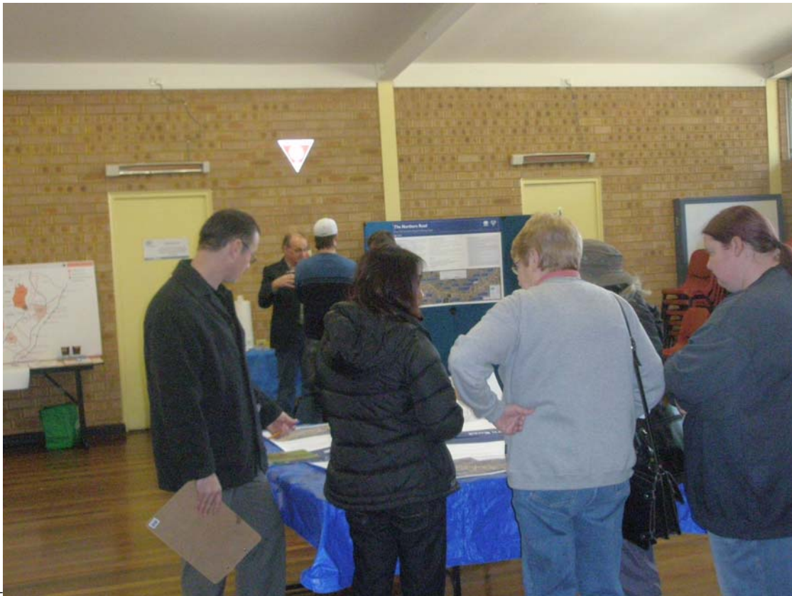
Community information session held on 7 August 2010 at Bringelly Community Centre.