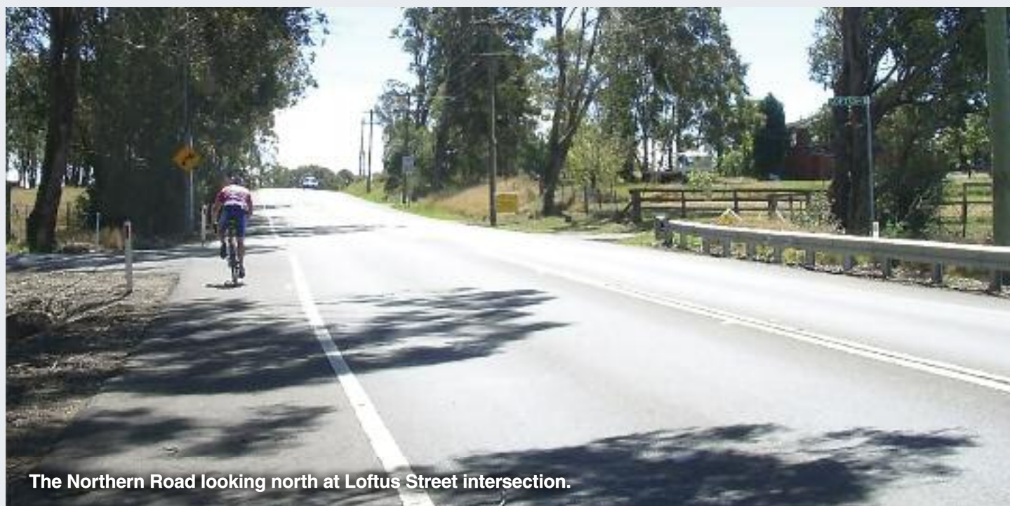
The Northern Road looking north at Loftus Street intersection.

RMS will undertake an environmental assessment with a view to minimising the impact of any road construction. Discussions will be held with The NSW Office of Environment and Heritage and the Department of Planning and Infrastructure to develop appropriate management strategies.