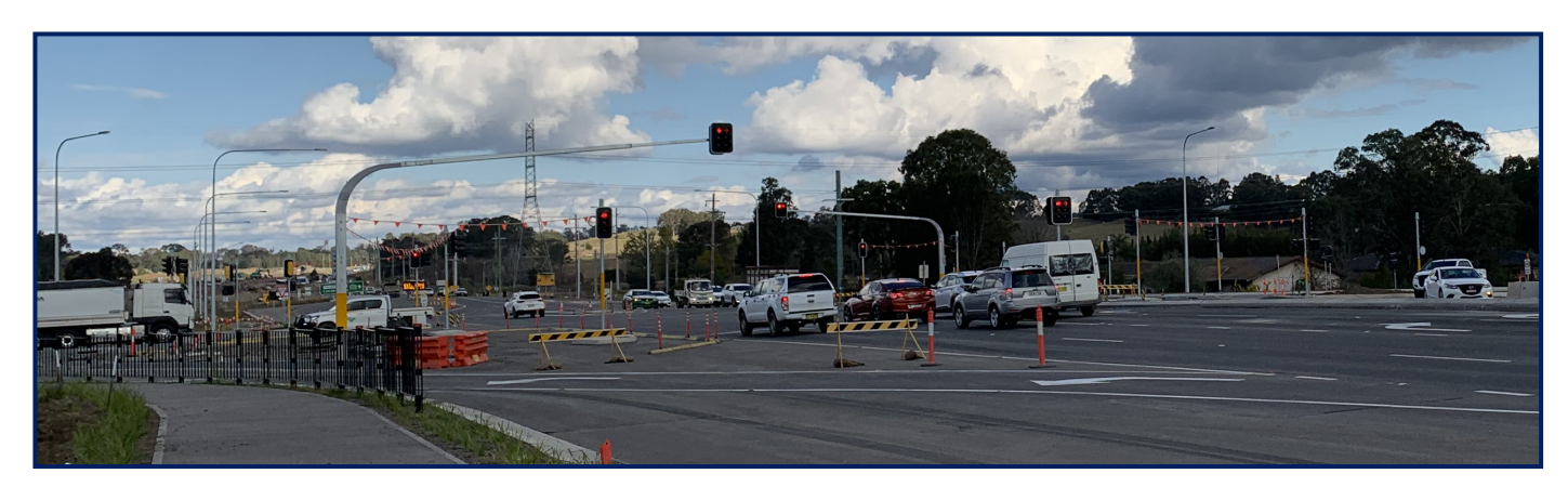
New traffic lights are now operating at the intersection of The Northern Road, Glenmore Parkway and Wentworth Road