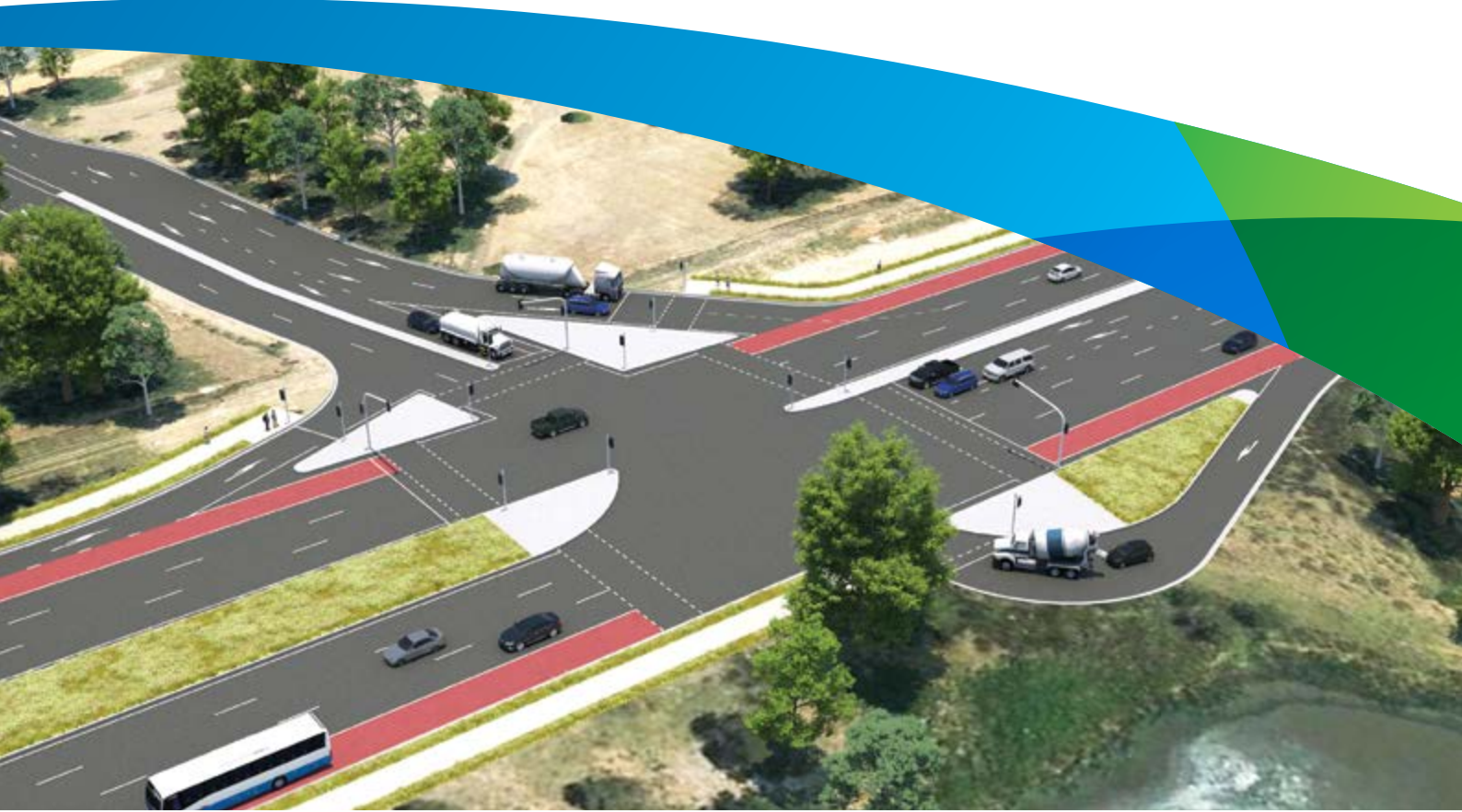
The Northern Road Upgrade at the proposed upgraded intersection at Bradley Street, Orchard Hills