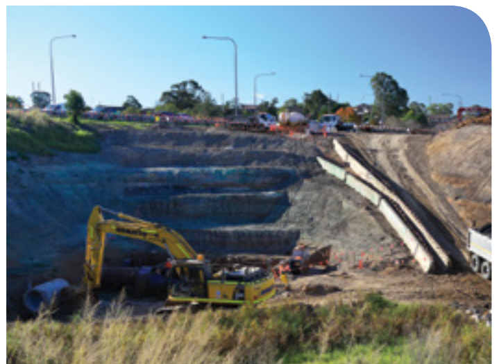
Drainage and foundation work at the new M4 Motorway interchange.

There may be impacts associated with this activity including noise and dust. These impacts will be managed proactively in line with the project's Construction Environmental Management Plan and Environmental Protection Licence approvals.