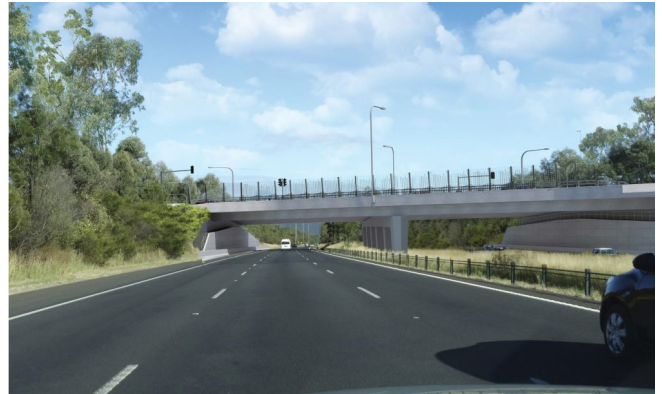
Artist's impression of the new M4 Motorway bridge with throw screens, east of The Northern Road, looking west.