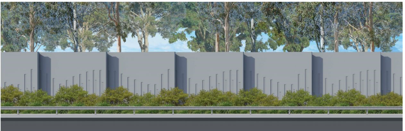
Artist's impression of noise barriers along the M4 Motorway and The Northern Road. Patterning for the noise walls is yet to be confirmed.