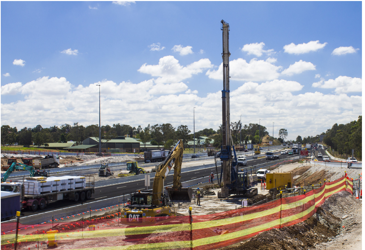
Piling work to construct the foundations near the existing westbound off-ramp, for the new M4 bridge and interchange at The Northern Road.

Work outside of these hours, including night work, will be notified in advance to reduce impact on residents and the travelling public.