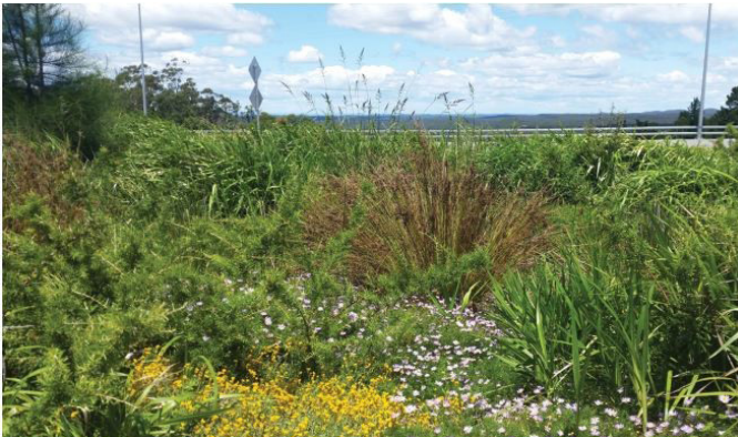
Landscaping and revegetation is designed to protect biodiversity. M4 Motorway and The Northern Road interchange includes native wildflower species.