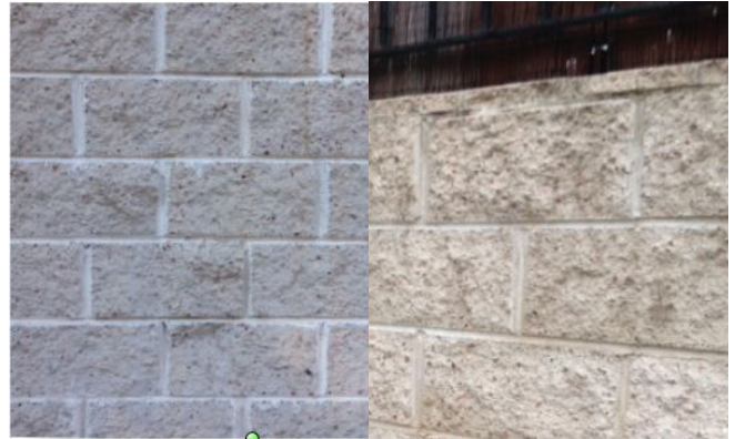
Concrete block retaining wall with split face (left) and with capping block (right).

Community Information Centre 1990 The Northern Road, Orchard Hills Enter via Wentworth Avenue Monday to Friday 9am–5pm