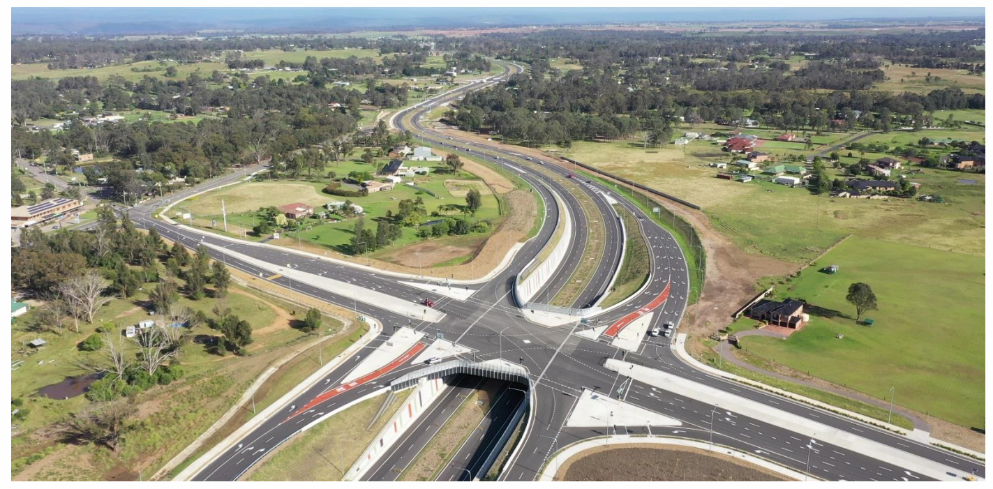
The Bringelly Interchange at Bringelly

The Northern Road and Bringelly Road upgrades will provide easier, faster and safer travel for motorists in western Sydney.