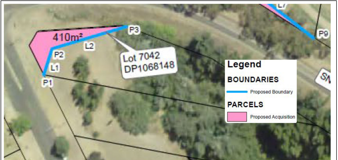
Figure 3-8 Proposed property acquisition 2 of 2 (Transport for NSW, 2021)