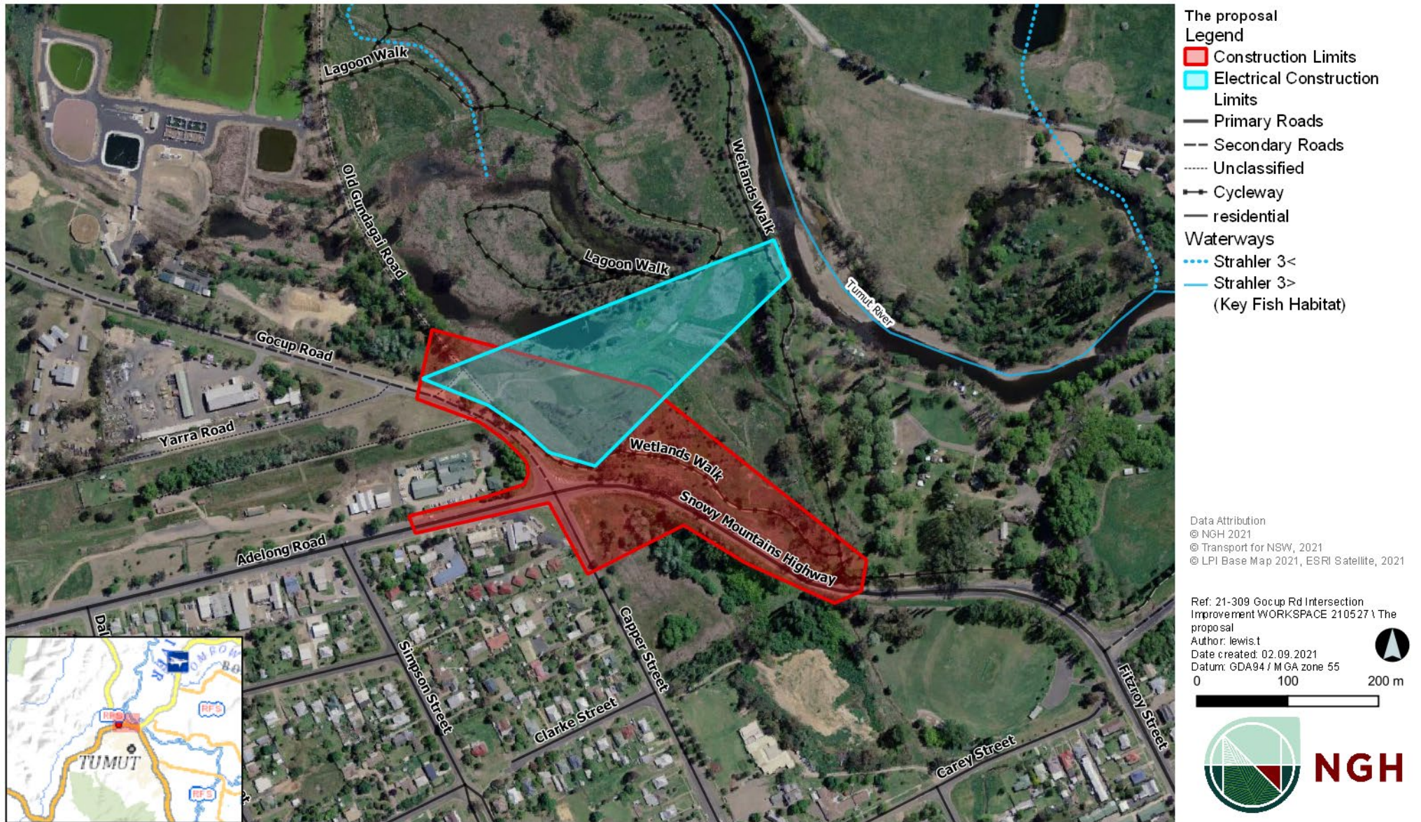
Figure 1-2 The proposal