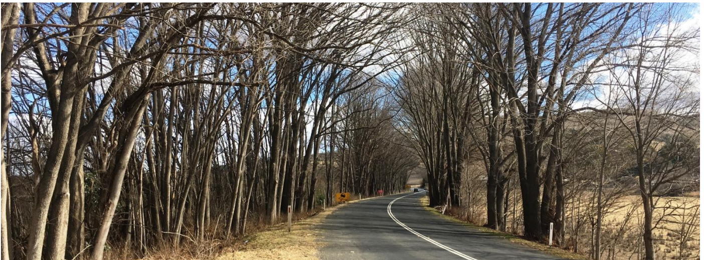
Vale Road, north of Perthville.