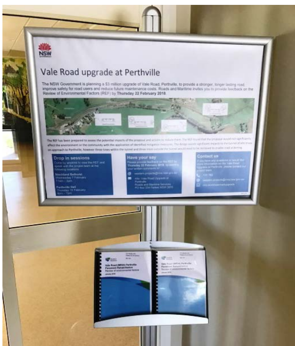
Display of the Review of Environmental Factors.

The final design for the proposal has been determined. Work is expected to start in April and finish in June 2018.