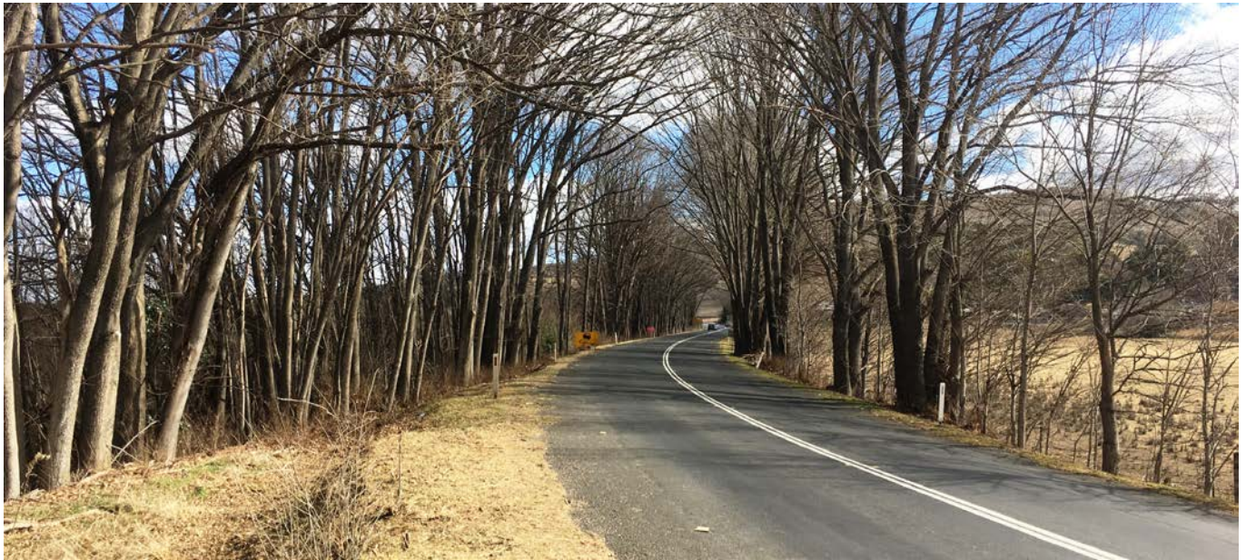
Vale Road, north of Perthville, is narrow with trees growing very close to the road

Roads and Maritime Services is planning a $3 million upgrade of Vale Road, Perthville, to provide a stronger, longer lasting road, improve safety for road users and reduce future maintenance costs. Feedback on the concept design is invited by Monday 30 October.