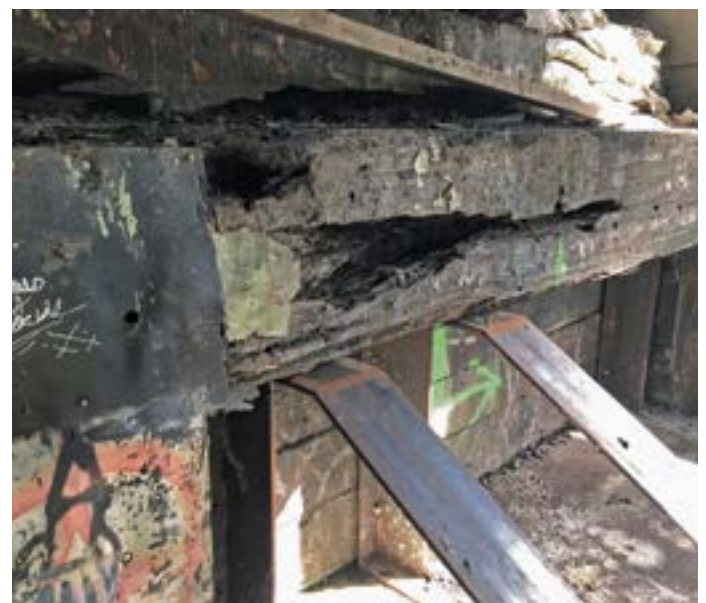
Existing Timber support structure dating back to 1897 to be replaced with concrete