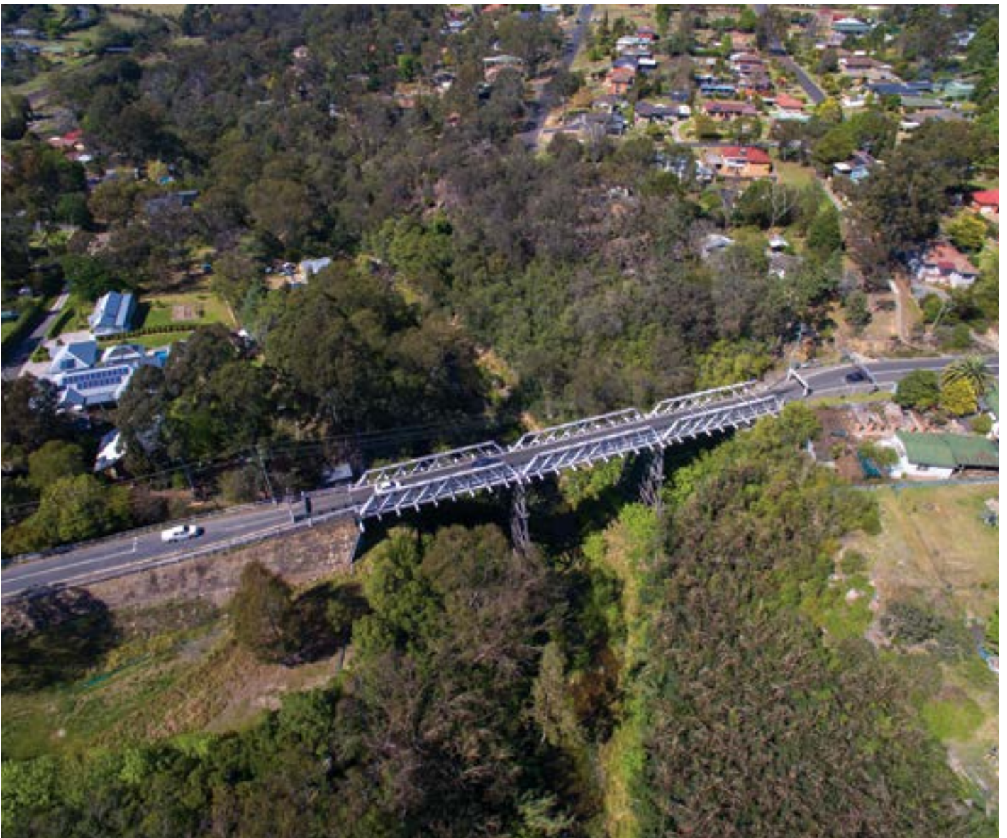
Victoria Bridge crossing Stonequarry Creek

A temporary site compound will be established on Prince Street as shown above. One lane of Prince Street will remain open at all times to allow residents to access their properties during the planned closure.