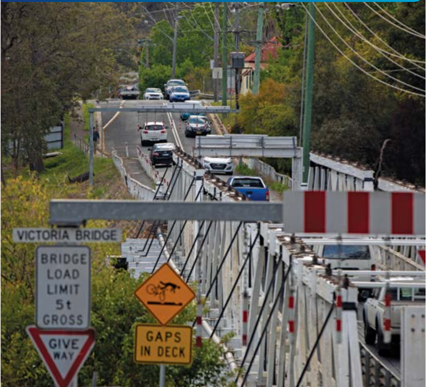
The Historic Victoria Bridge over Stonequarry Creek at Picton will be closed for four months to replace timber supports with concrete