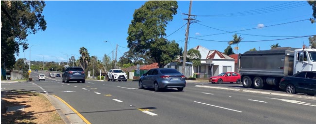
Intersection of Victoria Road and Pemberton Street, Parramatta