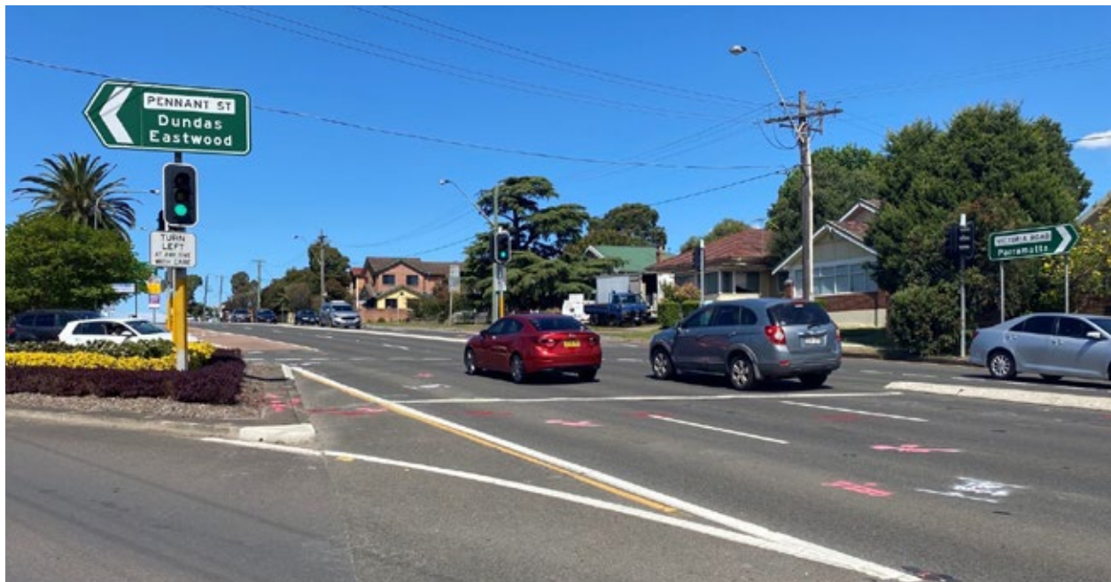
Intersection of Victoria Road and Pennant Street, Parramatta

The Australian and NSW Governments are investing more than $400 million to improve safety and reduce crashes on NSW roads.