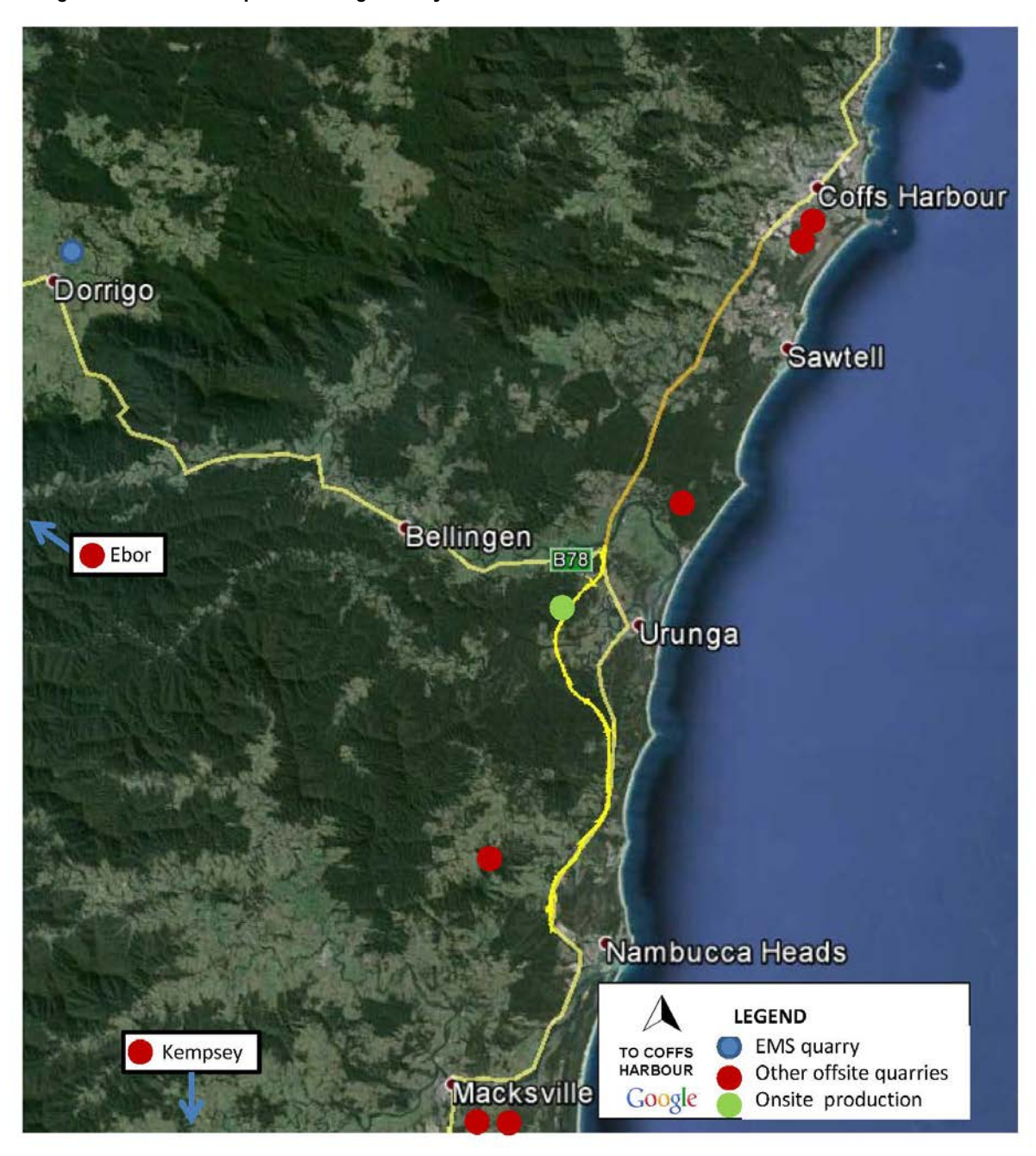
Figure 1 - Location of quarries being used by Lend Lease