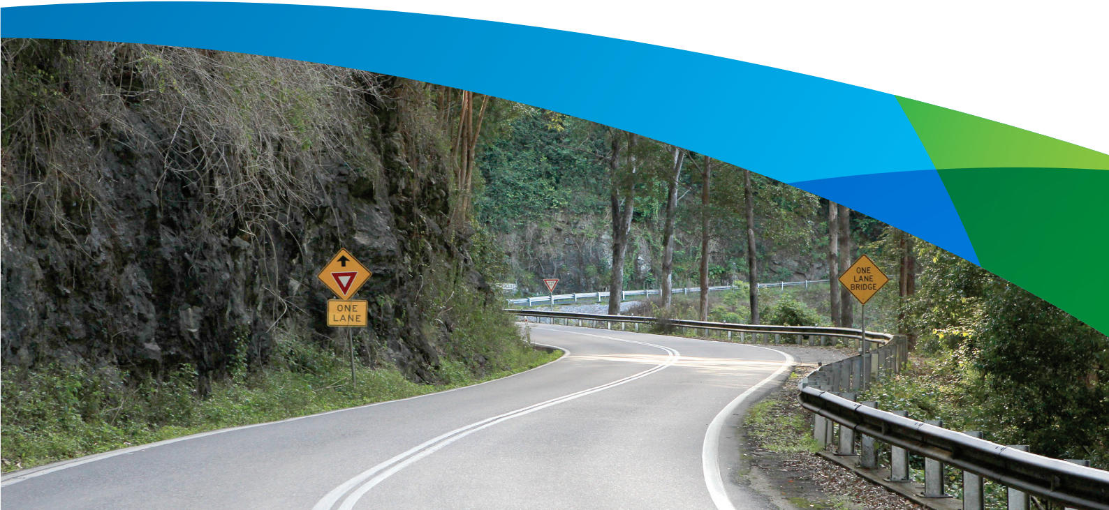
Location of the new 60km/hr speed zone