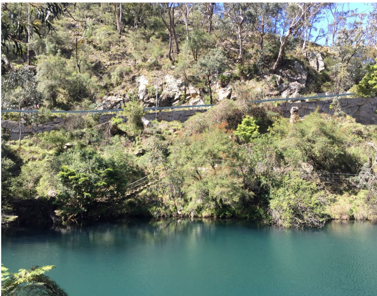
An artist impression of the shotcrete textured wall at Blue Lake

Work will involve scaling and removing loose material from the slope, installation of protective mesh, rock bolting and mock shotcreting which adds texture and colour to the concrete to give it a natural appearance. Construction is set to commence in early to mid-2022 and is expected to be complete in approximately 12 weeks, weather permitting.