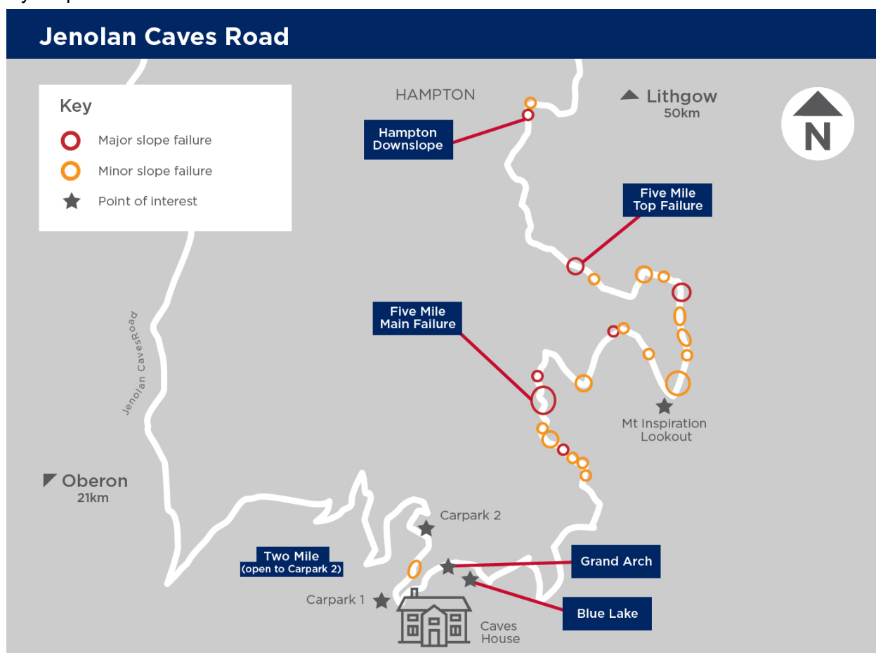
Map showing the location of slope failures in various sections of Jenolan Caves Road

Work is powering ahead to restore Jenolan Caves Road to pre-flood conditions with multiple teams assembled to finalise investigations and optioneering for Two Mile, Hampton and the Five Mile main failure as well as a second failure higher up the mountain. The task to repair these slopes is unprecedented – never have we seen such extensive storm damage on one road in New South Wales, and we’re working with experts across Australia and New Zealand to ensure repairs are carried out as quickly as possible.